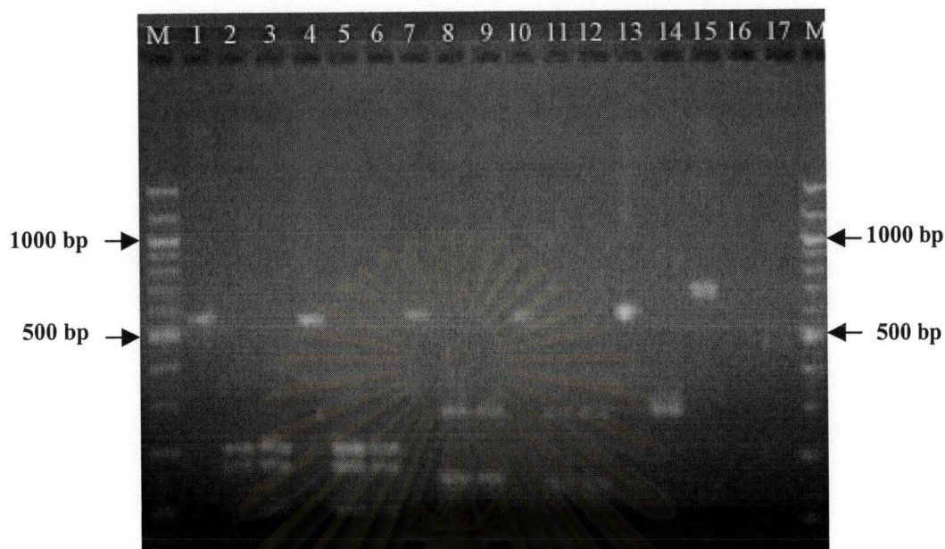
Figure 8 PCR-RFLP analysis of filarial ITS1 PCR products digested by Ase I. Lane M, 100 bp ladder; lane1, undigested Thai-Karen W. bancrofti (~570 bp); lanes 2-3, digested Thai-Karen W. bancrofti (~210/170/110/80 bp); lane 4, undigested Myanmar W. bancrofti (~570 bp); lanes 5-6, digested Myanmar W. bancrofti (~210/~170/110/80 bp); lane 7, undigested human B. malayi (~580 bp); lanes 8-9, digested human B. malayi (~290/150/140 bp); lane10, undigested cat B. malayi (~580 bp); lanes 11-12, digested cat B. malayi (~290/150/140 bp); lane 13, undigested cat B. pahangi (~590 bp); lane 14, digested cat B. pahangi (~300/290 bp); lane 15, undigested dog D. immitis (667 bp); lanes 16-17, digested dog D. immitis (455/212 bp).