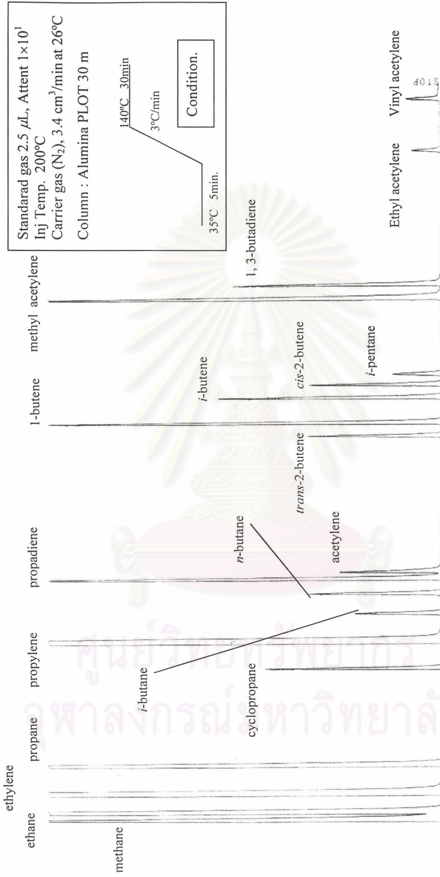
Figure A-1 The gas chromatogram of the standard-gas mixture obtained from GC.