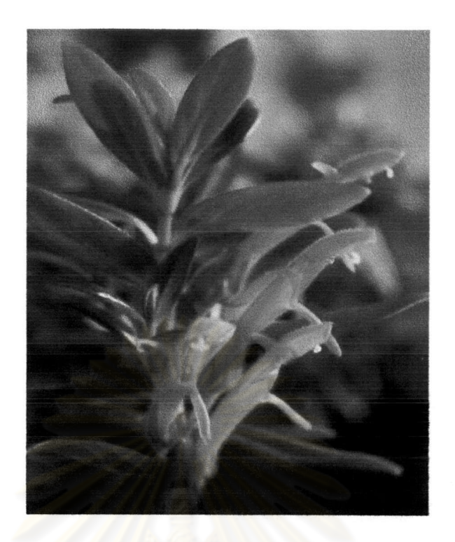
Fig. 45 Flower morphology of Columnae linaris.