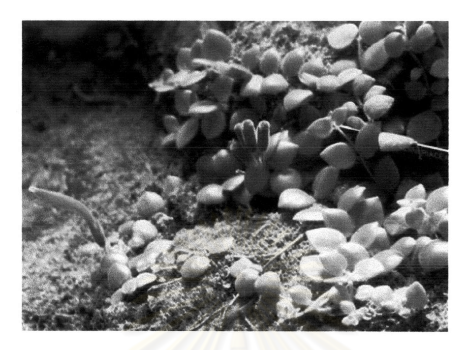
Fig. 47 Morphological characteristics of Aeschynanthus radicans.