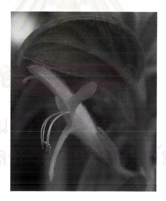
Fig. 46 Flower morphology of Columnae argentea.