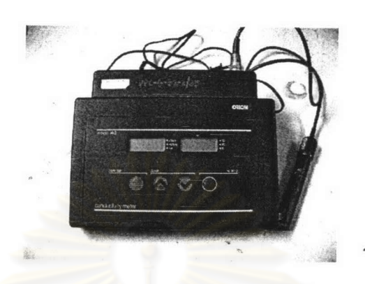
Figure 8 Orion 160 conductivity meter