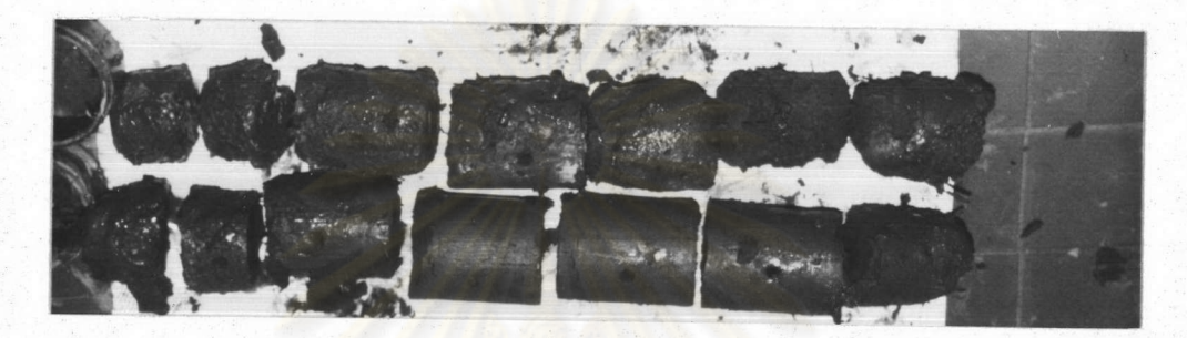
Khamphaeng Saen soil serie