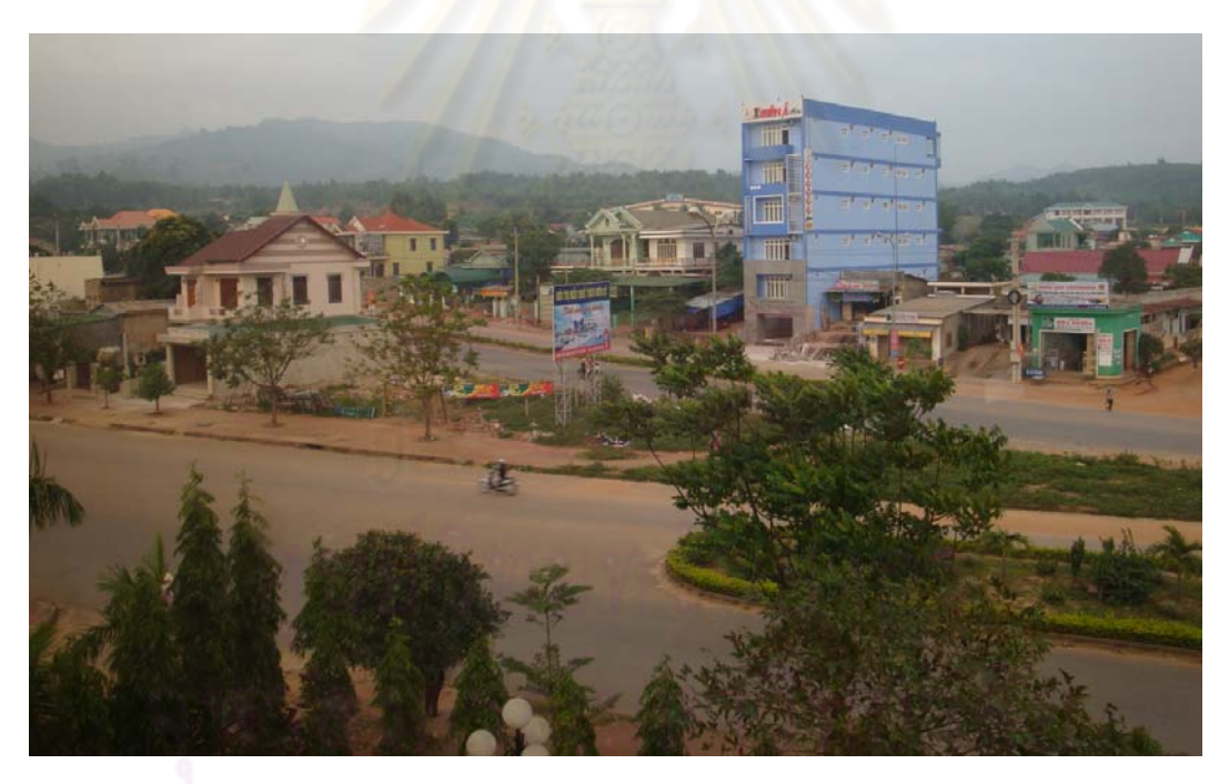
Figure 1. Lao Bao township nowadays— the center of Lao Bao SECA

After more than 10 years, Lao Bao SECA has developed strongly and comprehensively with a high economic growth rate annually and positive shift in economic structure. Potentials and advantages of the area have been exploited effectively; the area is on the way toward significant growth, and the living standards of residents