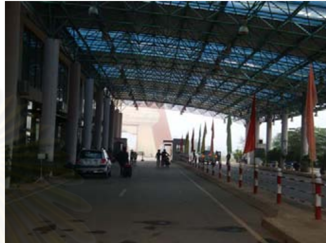
Figure 6. The customs declaration zone for entry at And opposite site for exit customs procedures Lao Bao border gate