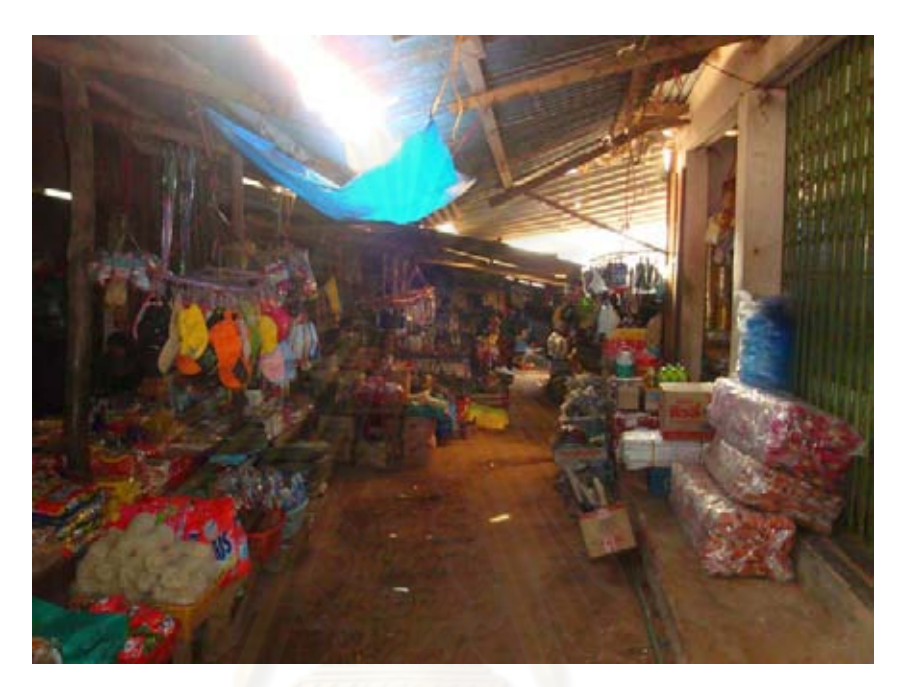
Figure 7. Karon market in Dansavanh border area of Laos

centers in that area. The closest market near Dansavanh border gate is called Karon market. It is the gathering place for transit goods. The market is not well planned, and it is crowded on Lao Bao sides.