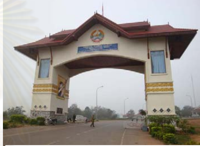
Figure 5. Lao Bao International Border Gate with a shape of Vietnamese copper-drum