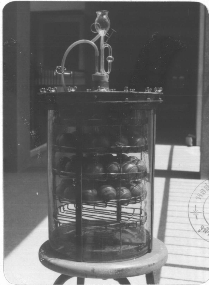
Figure 2 . Experimental Glass Jar with Stainless Steel Shelves and Iron Cover.