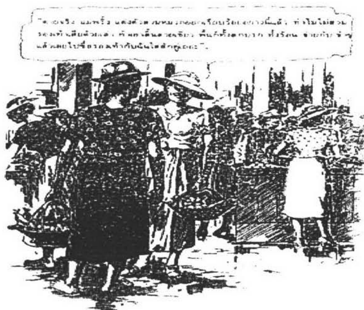
Figure 2 The Hats would lead the Thai Culture or "Mala Num Thai"