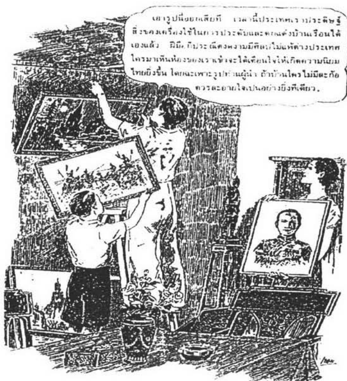
Figure 1 the picture of the leader which was part of nationalistic program during the period of field marshal Phibunsongkhram. There were the pictures of the leader n everywhere