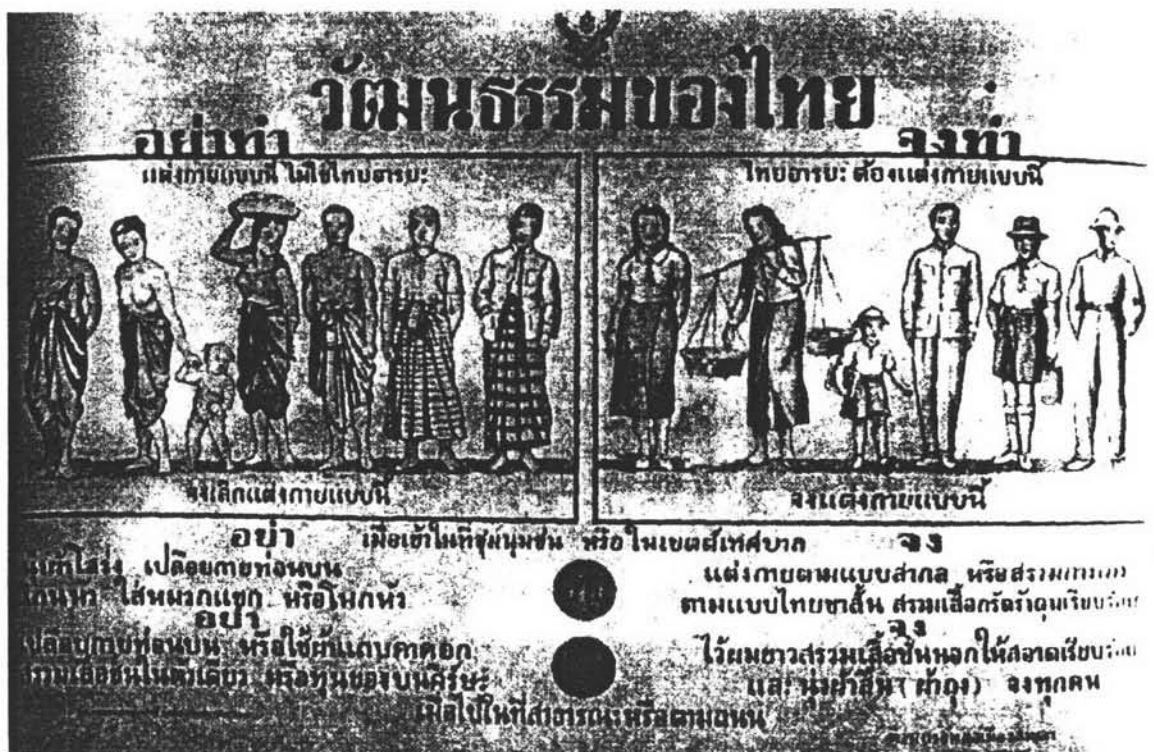
Figure 4 Thai proper cultures