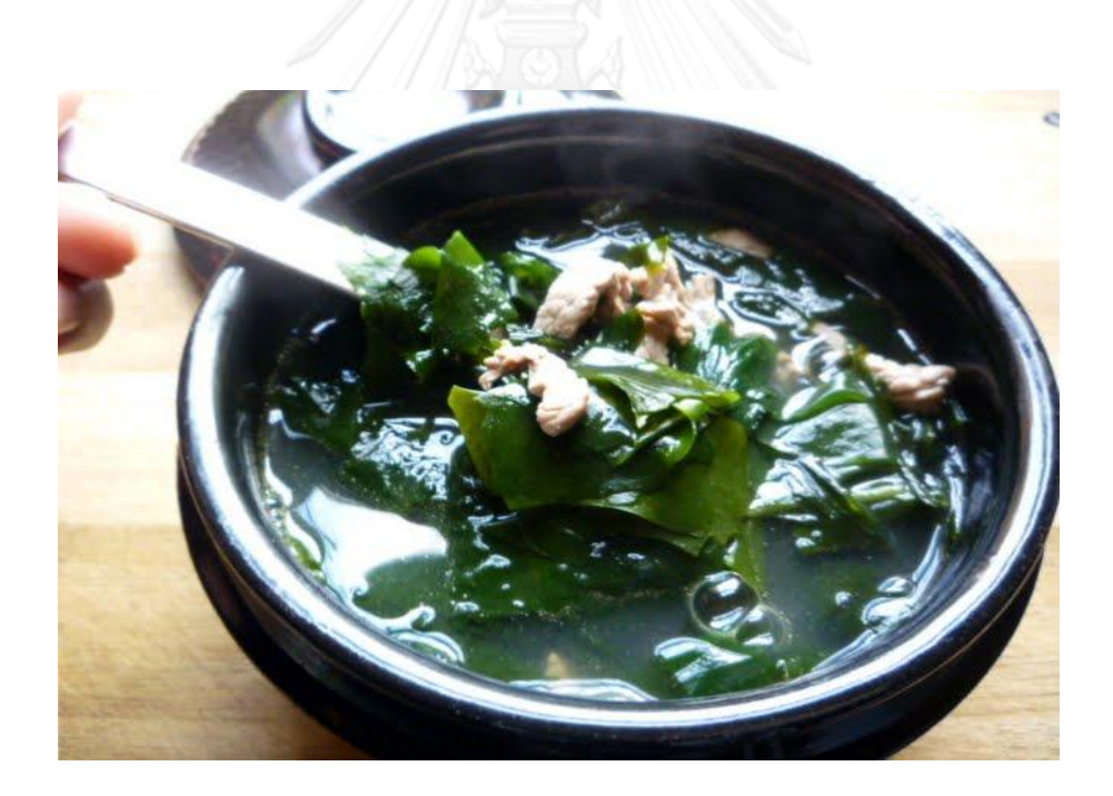
Figure 5: Korean seaweed soup Miyeok Guk