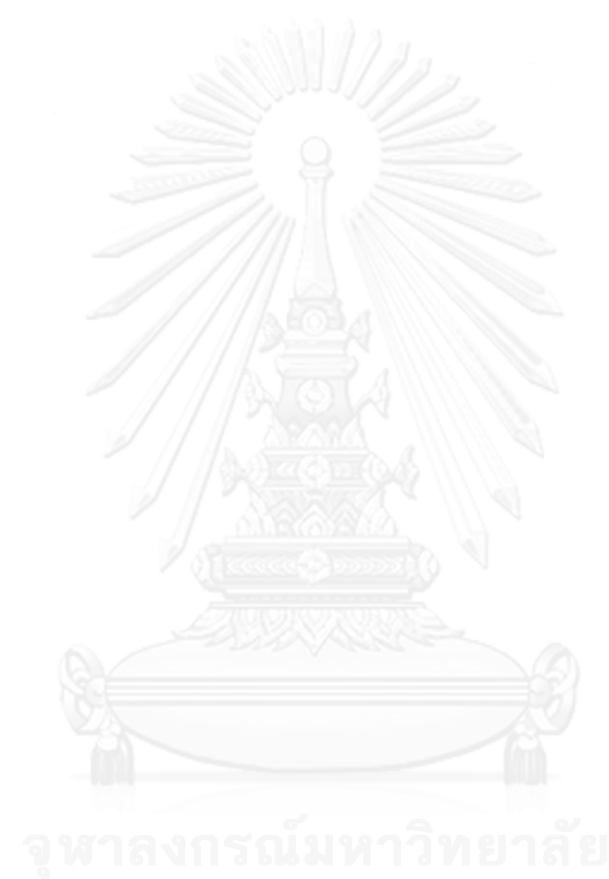
จุฬาลงกรณ์มหาวิทยาลัย Chulalongkorn University