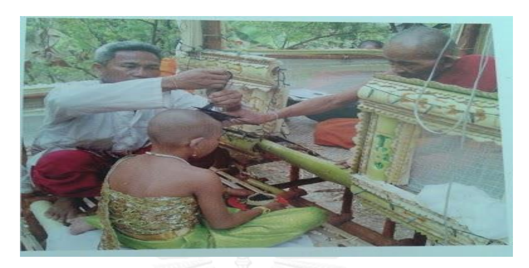
Figure 18: The Cambodian traditional shave hair from the monk. Reference: Ly Sovy's Books "Cambodian Culture", (P 10, 2010)