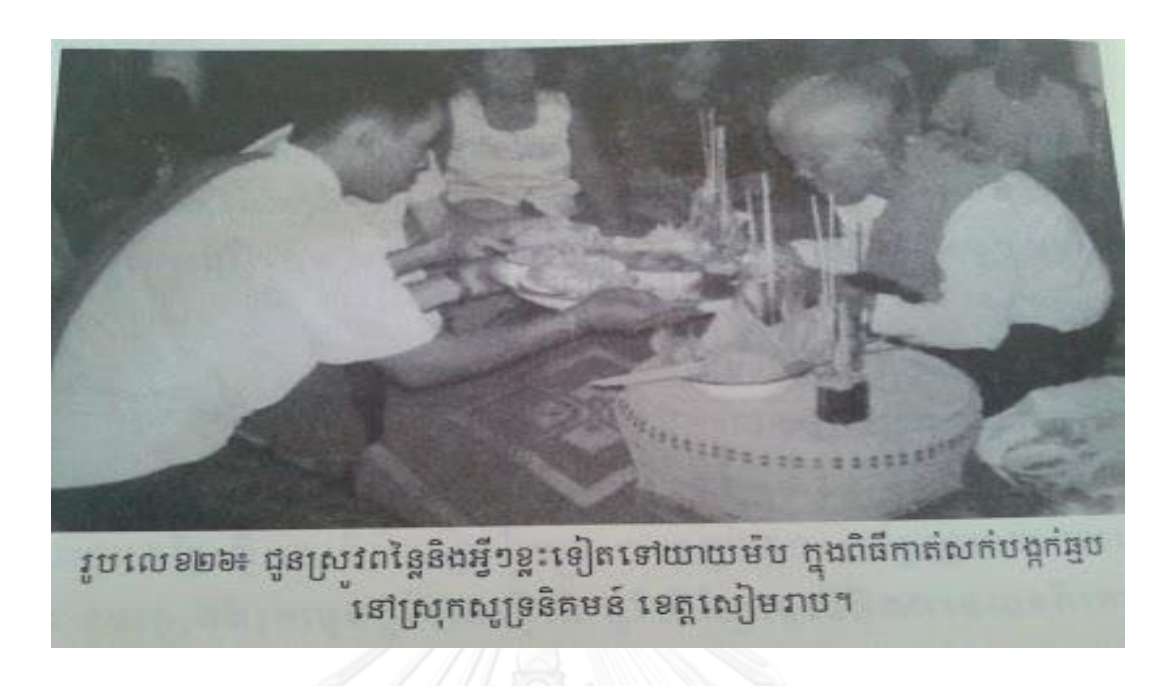
Figure 20: Ceremony for giving thanks to midwife

Reference: Insulin Choulean's Books "Ceremony related with Rice", (P 88, 2011)