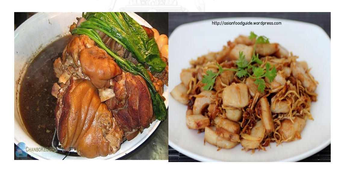
Figure 13: Cambodian foods for women after childbirth for helping mother to have warm body inside and increasing milk for the baby.

Reference: https://www.google.co.th/search?q=ក្លាន&source