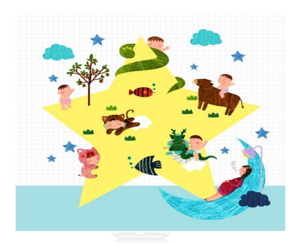
Figure 3: Tae Mong, "Tae" means womb and "Mong" means a dream. So if the baby's mother or member's family dream of flowers then it indicates the baby will be a son. Furthermore, if see fruits in their dream the baby will be a daughter.

Reference: http://fromkoreawithlove.org/tag/samshin-halmo