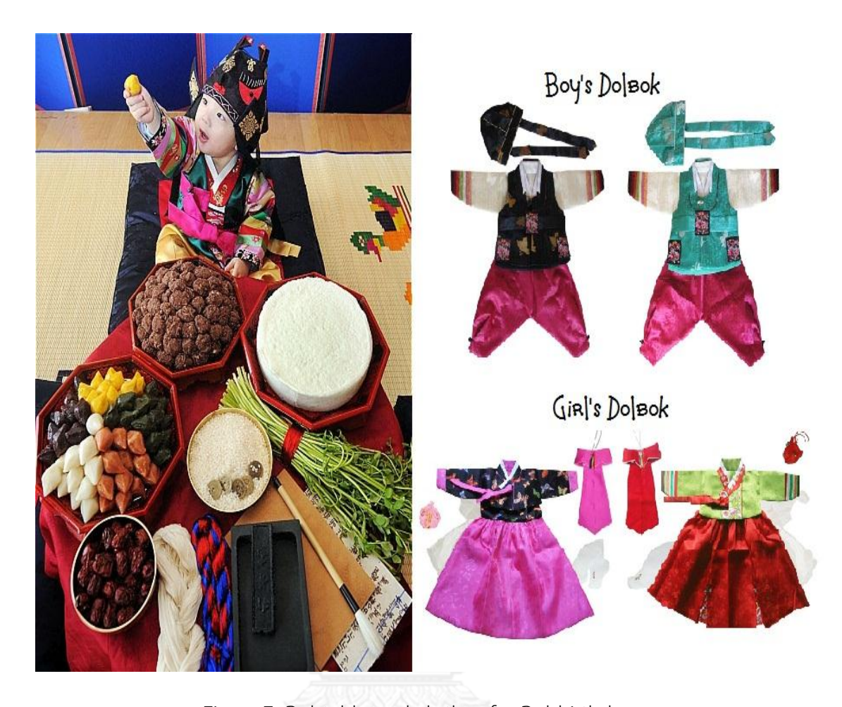
Figure 7: Dol table and clothes for Dol birthday.

Reference: https://www.google.co.th/search?q=korean+dol+birthday&source