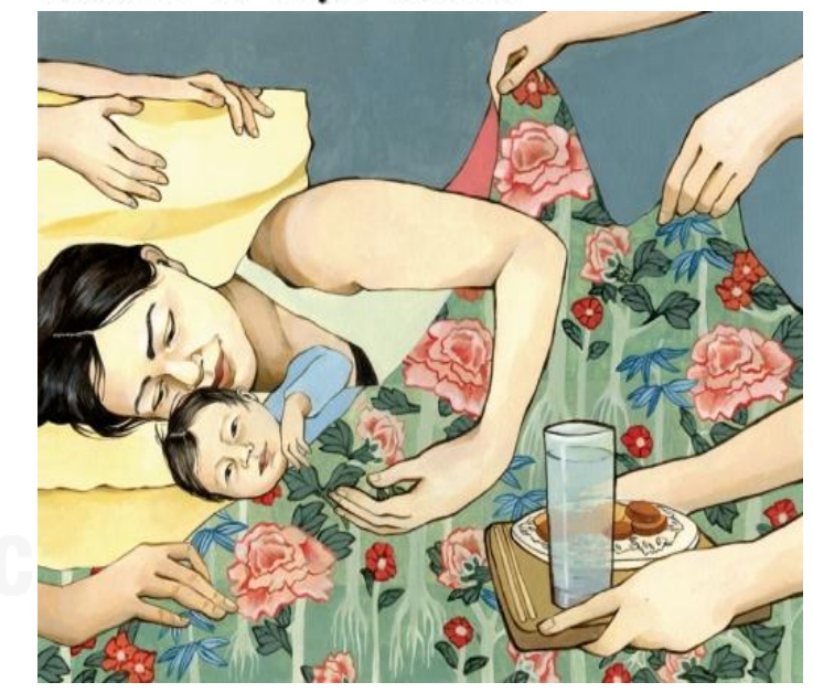
Figure 6: Mother needs to stay in the warm place

Doctors urge mothers to stay warm. So even through childbirth no icechips are given and she cannot bathe. Once home, a new mother is kept warm.