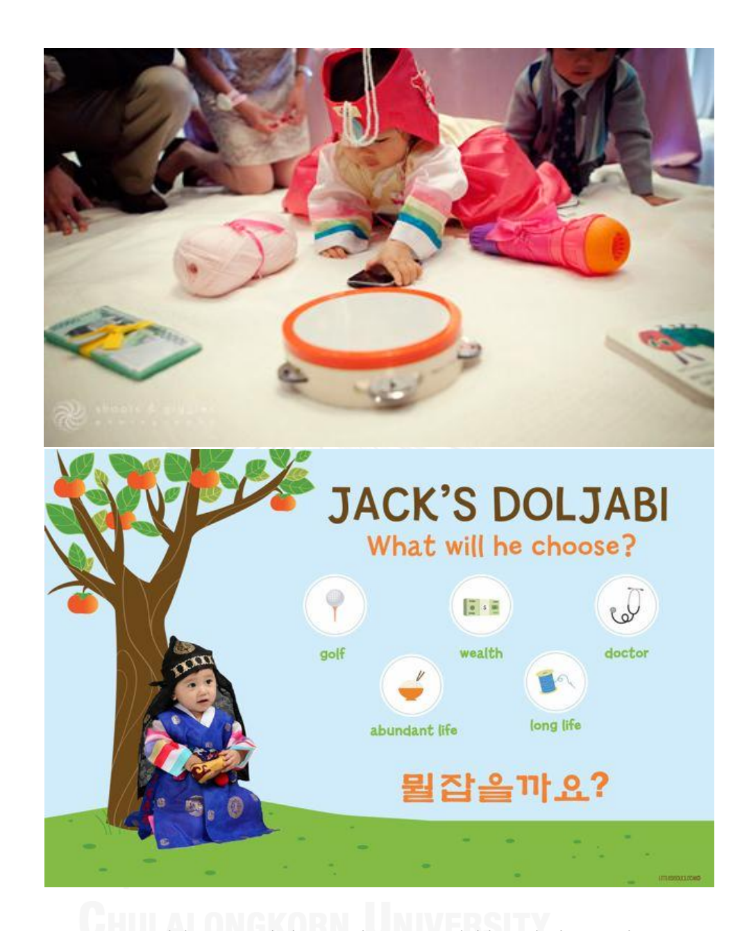
Figure 8: Korean dol: New Doljabi Boards now available at little Seoul party

Reference: http://littleseouls.blogspot.com/2010/09/korean-dol-new-doljabi-boards-now.html