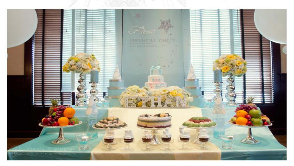
Figure 11: Korean Dol Orange County in Modern style

Referenthttp://ummamamdolsang.blogspot.com/2010/05/dolsang.htmlhttp://ummamamdolsang.blogspot.com/2010/05/dolsang.html