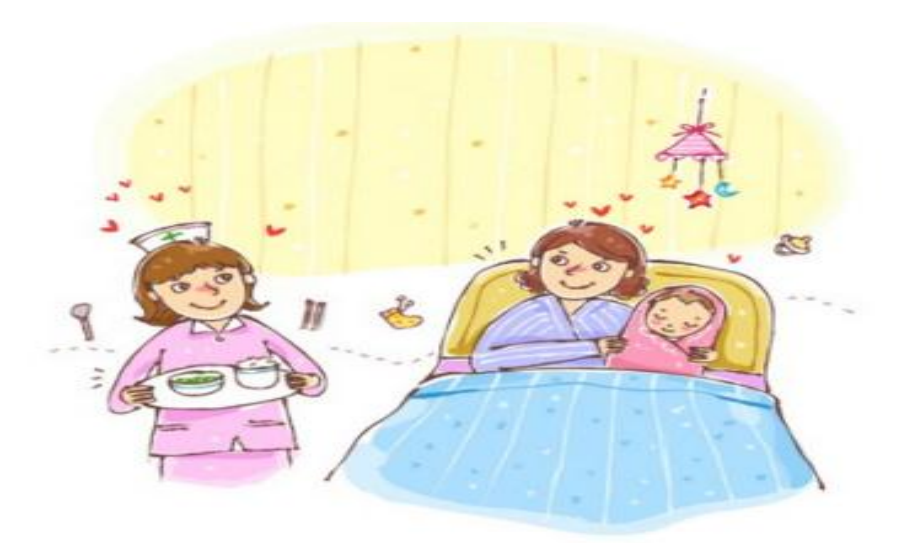
New mothers should eat Miyeok guk 미역국, a seaweed soup to stay healthy for her newborn.