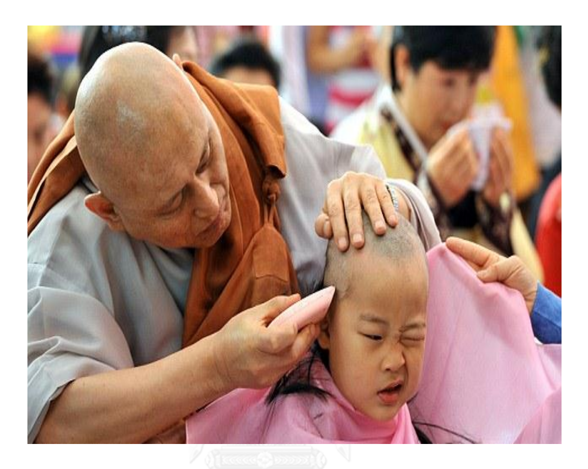
Figure 9: The South Korean kids get their heads' shaved by a Buddhist monk during the Children Becoming Buddhist monks' ceremony at Jogye temple in Seoul.

Reference: http://www.dailymail.co.uk/news/article-2144012/Young-monks-south-Korea-heads-shaved-initiation-Buddhist-order.html