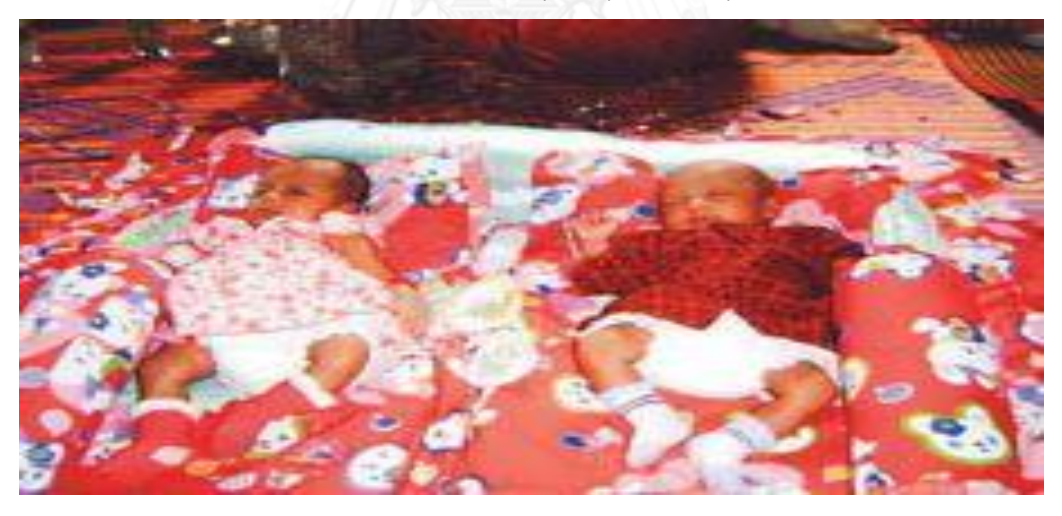
Figure 15: Baby boy marries twin sister in Kandal province, Cambodia