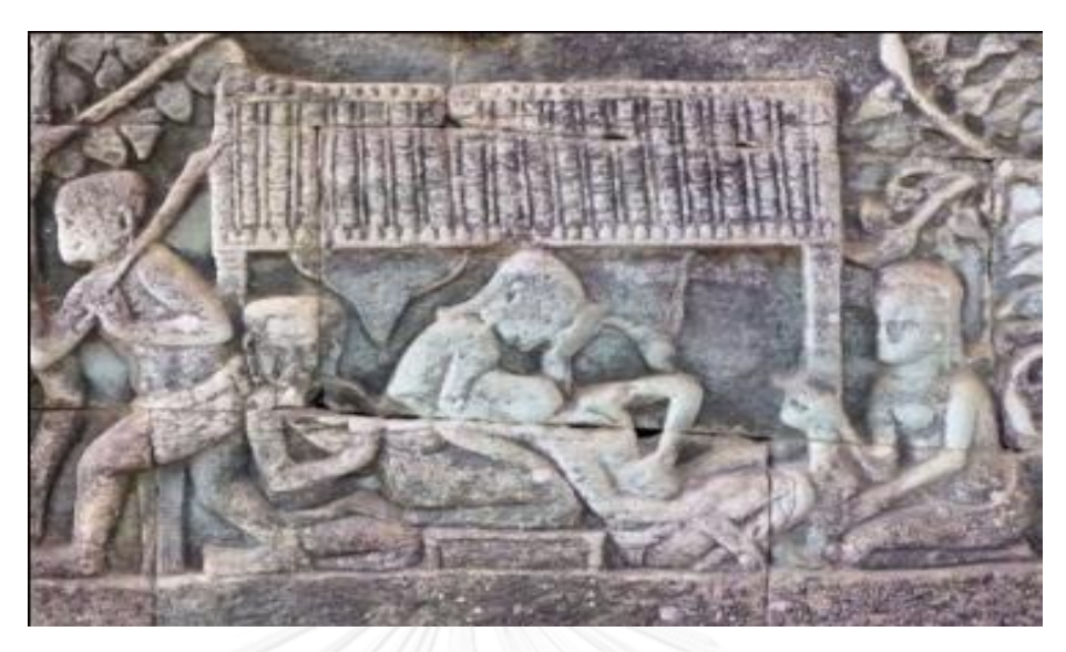
Figure 16: Cambodian midwife in the past helping women give the birth for child. (on Stone, Bayon temple, Angkor Wat Temple)

Reference: https://www.google.co.th/search?q=Cambodia+midwife&source