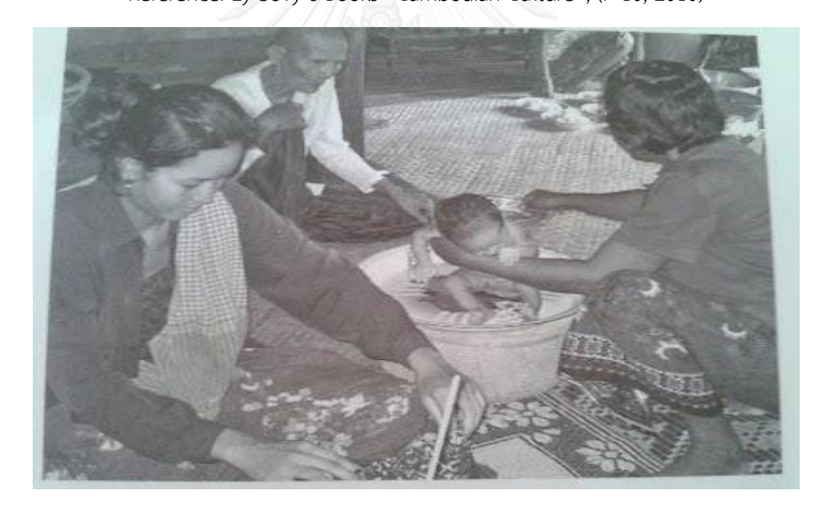
Figure 19: The Cambodian midwife taking a shower to the child after born 3 days and cut the first hair of child to wishes good luck.

Reference: Insulin Choulean's Books "Ceremony related with Rice", (P 89, 2011)