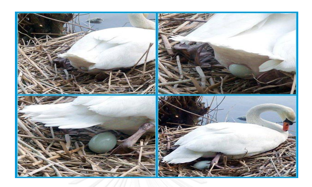
Figure 12: Swan eggs are the best food for Cambodian women during pregnant, they believe will help her child smart and good health.

Reference: https://www.google.co.th/search?q=ក្លាន&source