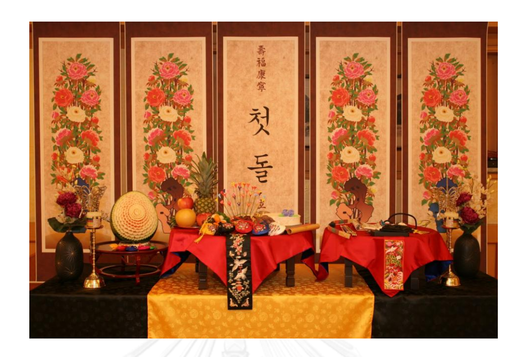
Figure 10: Korean traditional Dol's table

Referenthttp://ummamamdolsang.blogspot.com/2010/05/dolsang.htmlhttp://ummamamdolsang.blogspot.com/2010/05/dolsang.html