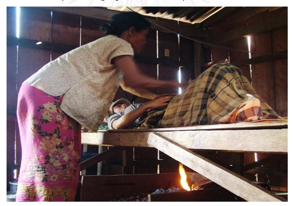
Figure 17: Cambodian Traditional midwife at North-eastern of Cambodia

Reference: https://www.google.co.th/search?q=Cambodia+midwife&source