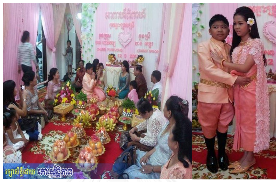
Figure 14: Twin's marry