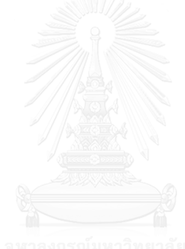
จุฬาลงกรณ์มหาวิทยาลัย Chui ai nagkarn University