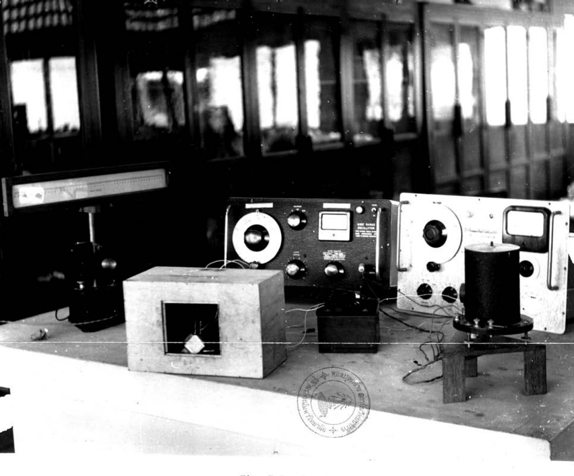
Fig. 3.3 The Apparatus