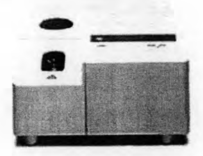
Figure 14 Differential scanning calorimeter (DSC822°, Mettler Toledo, Switzerland)