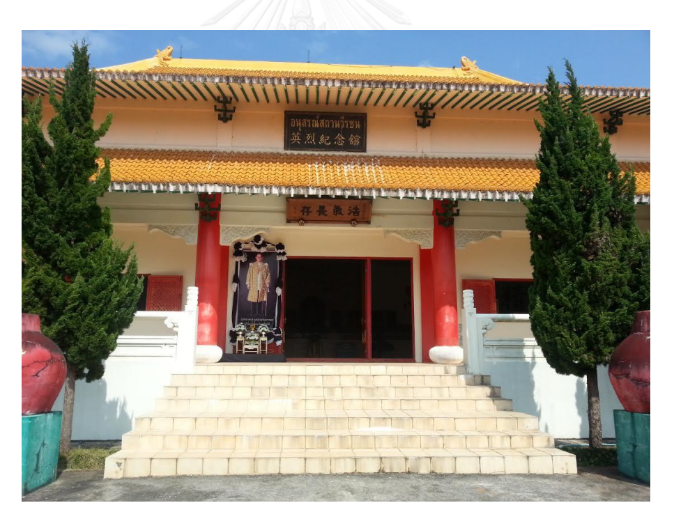
Figure 14: The solemn portrait of the King Bhumibol Adulyadej in the mourning hall of Civil Museum of Northern Thailand.

shang (皇上, official term for "emperor" in old Chinese) in the Yunnan dialect in order to show their highest respect for the royal family. In most of the ritually important living rooms of Yunnanese houses in Ban Hin Taek, both the portrait of Thai royal family and the family's ancestral tablets are enshrined and worshiped in the daily life of Yunnanese families. Today, when royalty like Princess Maha Chakri Sirindhorn visits the village, the village committee of Ban Hin Taek sends representatives of Yunnanese and other local ethnic minorities to attend the activities, showing the importance of retaining local ethnic difference before the representative of the Kingdom of Thailand. Many local Yunnanese families consider being present before the Thai royal family as the supreme honor, and as a crucial step to relate themselves with Thai society, as seen by the photographs and other memorabilia they keep of these events.