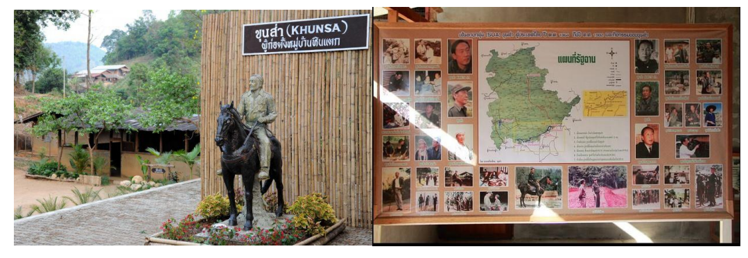
Figure 16: Khun Sa's memorial Museum in Ban Hin Taek village

Ban Hin Taek village, by contrast, has also been home to Yunnanese people for many decades, and it has kept close connections with KMT Yunnanese after Khun Sa made it a key base, and due to his personal relations with KMT force. The relation between Khun Sa and KMT forces in this early stage could traced back to the early 1950s, after the KMT forces completely failed in the Chinese Civil War and withdrew to Thai-Burma border in late 1950s, and a part of remains of KMT force were split into several local armed forces in both Burma and Northern Thailand. A part of these KMT forces established a provisional Military University 'the University of Anticommunist & Soviet Union' in Monghast of Burma. According to the exhibition contents in the Civil Museum of Northern Thailand, although this provisional military university only existed for two years, it trained a number of controversial leaders in the local armed forces of the Golden Triangle area: besides Khun Sa, there was Lo Hsing-han, Pheung Kya-shin, and others.