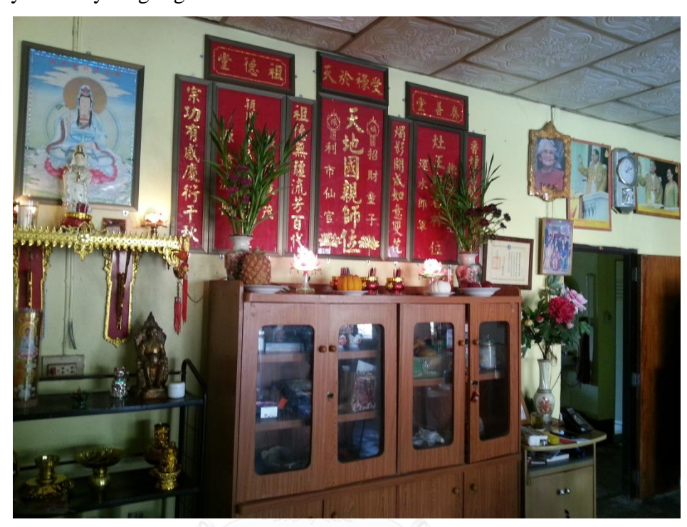
Figure 10: The interior decoration of Yunnanese villager-Mr. Wang's (pseudonym) House in Ban Hin Taek village.

to be a real Thai, which is good for our young generation to make a living in Thailand." This case also shows the flexible ways that Thai identity is negotiated by the Yunnanese living in Ban Hin Taek and how they understand the value of Thai identity for the younger generation of Yunnanese.