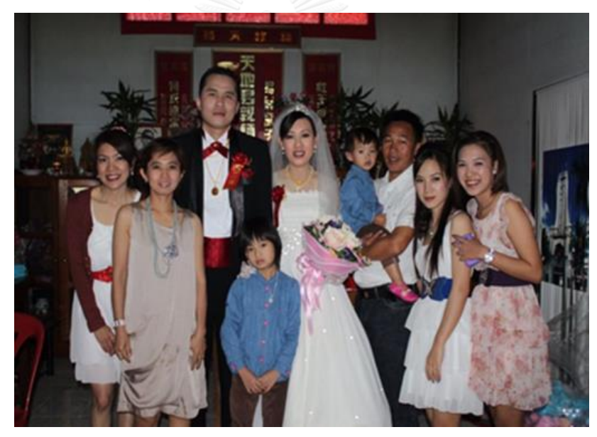
Figure 6: The Yunnanese-Shan intermarriage wedding in Yunnanese bridegroom's house

of wedding was finished after the bride and bridegroom exchanged bows. By contrast, the Yunnanese group has paid more attention to entertain their guest of wedding. In this case, the bridegroom's family have not only invited their relatives, friends and bride's families to attended wedding ceremony, but also widely invited the leader of village committee, the headman of each local ethnic minorities and even the some leader of local armed forces of Myanmar to join the da-ge (is a folk dance which popular in southwestern Yunnan) in evening party. Whether in wedding or special festival, da-ge is an indispensable folk custom among some local ethnic minorities of Ban Hin Taek that made each ethnic minority could celebrate with host family through dance. Even though the da-ge was not belong to the Han tradition in wedding ceremony, majority of Yunnanese Han family in Ban Hin Taek nowadays has well