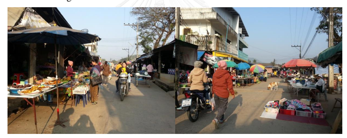
Figure 7: The morning market in central area of Ban Hin Taek village

Fa Luang area from Mae Chan district, this district was officially upgraded to a full district on 5 December 1996.<sup>21</sup> In addition, the Ban Hin Taek area has completely set up as center of trade and merchandise's distributing during Khun Sa period. Hence, Ban Hin Taek village is still the major trading center of upland area in Mae Fa Luang district after this place has fully opened the door to lowland Thai society in Chiang Rai province. With the transformation of the mode of life among Yunnanese, Shan, and other ethnic minorities since the early 1990s, the original mountain trade was unable to meet the consumption demands of modern product for the local residences in Ban Hin Taek and it neighbor villages. And the poor agriculture situation of mountainous region was also unable to ensure the daily food supply in Ban Hin Taek area. As the central town of the Mea Fa Luang district, the Ban Hin Taek was naturally developed as one of biggest trade center that closely linked with the lowland market of Chiang Rai.