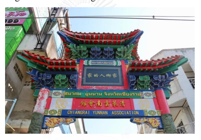
Figure 18: Yunnan Association of Chiang Rai

Chiang Mai. As a result, because of the use of educational resources and support from the PRC, in 2010, the Chinese Teachers' Association of Chiang Mai (which includes 23 local Chinese schools in Chiang Mai province) separated itself from the former Yunnanese institution which retained strong ties to the Kuomintang Party of Taiwan (which had returned to power in 2009). And then, in 2011, the Chinese Teachers' Association of Chiang Mai became the Senior High School of Chinese Teacher's Association of Chiang Mai (Qingmai gaoji jiaolian zhongxue, 清迈高级教联中学) in Arunothai village (บ้านอรุโฉนทัย) of Chiang Mai. It is the main co-operating Chinese educational institution in Northern Thailand for both the Chinese Teachers' Association of Chiang Mai and the PRC government.