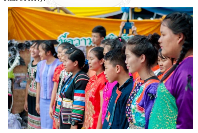
Figure 15:The highland minority student from the Patrol Police School of Ban Hin Taek to attend local government activity

commented to me, since the various Thai education project was widely available for marginal groups in upland Northern Thailand, the sense of belonging of ethnic identity and Thai identity for those younger generations of Yunnanese and other local ethnic minorities has transformed "because of their having passed through the full Thai education system, learning the language, and about the monarchy, religion and modern Thai history and culture". The regulation of the local Thai School tried to create a monolingual environment for these students to strengthen a sense of being part of Thai culture and participating in Thai identity. The two Thai schools also usually holds large ceremonies in important festival times like for Wai Kru [for honoring teachers], Mother's Day, and Father's Day, which were required by the parents of students to participate in and which helped form a sense of Thai identity. But the Yunnanese people approved of the idea of these Thai traditional ceremonies since they are similar to those in traditional Chinese culture shaped by Confucian values. The Yunnanese parents also consider Thai education as an effective way to help their children to gain social recognition in today's Thai society. Moreover, most Yunnanese people in Ban Hin Taek regard assimilation as the main strategy for Yunnanese villagers in Ban Hin Teak to escape the stigma and stereotypes still in some parts of Thai society.