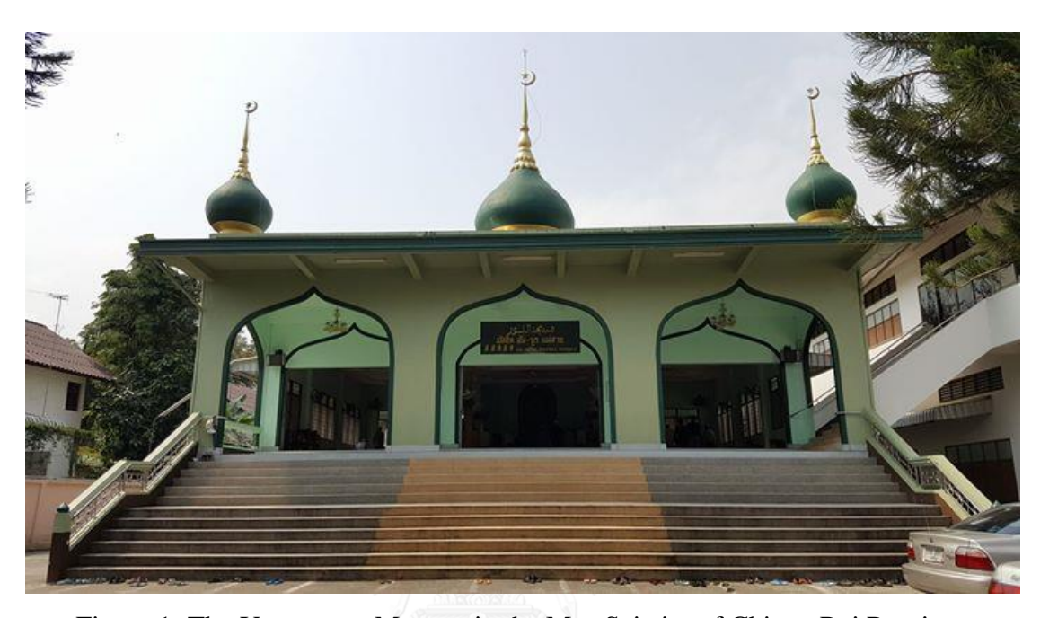
Figure 1: The Yunnanese Mosque in the Mea Sai city of Chiang Rai Province

homeland. This kind of opinion has deeply rooted in sensibility of Muslim people in Yunnan during that time. Besides, the failure of Panthay Rebellion also led to many Yunnanese Muslims fleeing to Southeast Asia.