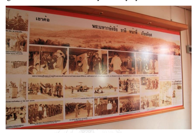
Figure 12: Plenty of images of Thai Royal family have been displayed in Civil Museum of Northern Thailand.

issue Thai citizenship to those Yunnanese soldiers after they completely wiped out the Hmong communist force along the Thai-Lao border area. A series of philanthropic acts of King Rama the Ninth and Thai royal family had a great influence on the Yunnanese in upland Northern Thailand. As a crucial turning point of the Yunnanese there, the recognition of and ties to Thai royal family by the Yunnanese strengthened.