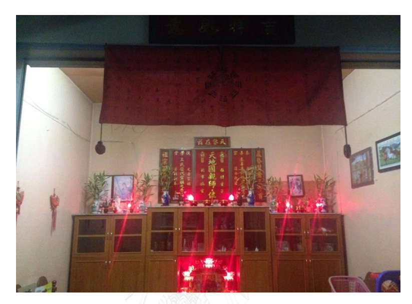
Figure 4: The traditional Tablet of Tian-Di-Jun-Qin-Shi in Yunnanese Home

or language advantages of the Yunnanese in Ban Hin Taek allows them to use multiple strategies to negotiate with different local ethnic minorities. This skill has helped them strengthen their group status in the village and in upland society.