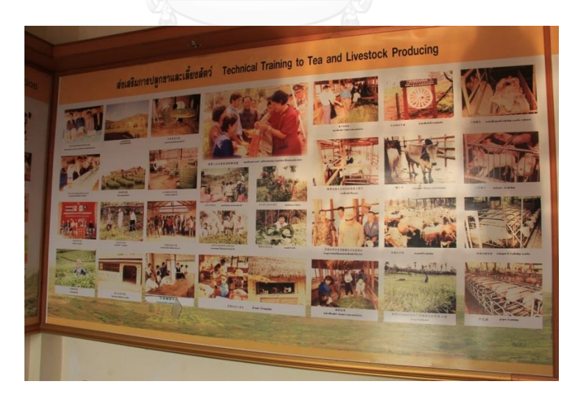
Figure 13: Plenty of information about "the royal assistance to Yunnanese people" has been displayed in Civil Museum of Northern Thailand.