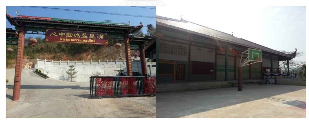
Figure 8: The Auditorium of Activity Center ( hui-guan ) in Ban Hin Taek village

In central Ban Hin Taek village, there is a Ritual Activity Center of Ban Hin Taek close to the local market. This auditorium is known as the "hui-guan 会馆or li-tang 礼堂 (meaning "guild hall" or "ritual hall," respectively)" by most local residents, and it can accommodate nearly 1000 people for community activities. The sponsoring organization for built this Ritual Activity Center of Ban Hin Taek is the Local Autonomic Committee of Ban Hin Taek village, and all construction fund of this auditorium were donated by nearly all villagers in Ban Hin Taek. The major donors of construction fund were the Yunnanese, Shan, and a smaller part by other ethnic minorities. The architectural modeling of this building is modeled on ancestral temple (in Chinese: zongmiao 宗庙) of northern mainland China, which is received significant influence of the architectural culture of late Qing Dynasty and architecture style of Confucian Temple. This auditorium was built by late 2015 and used at the end of 2015.