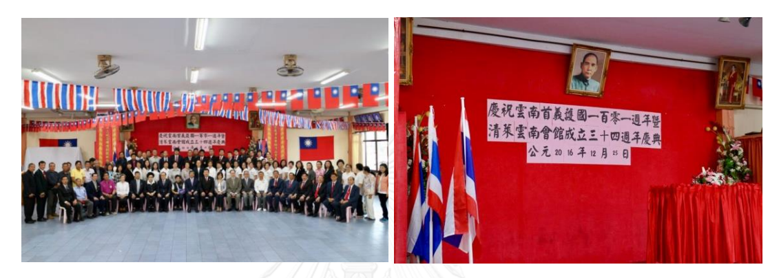
Figure 21: The activity for Memorial Day of Yunnan's National Protection War in Yunnan Association of Chiang Rai

Thailand, the former KMT soldiers in Yunnanese villages and Chinese teachers were invited as representatives. Like other Yunnanese villages in Chiang Rai province, the village committee of Ban Hin Taek would send several Yunnanese people as representatives to attend this social activity in the Yunnan Association of Chiang Rai. This activity was generally held as a banquet, where all participants were required to stand up and first sing the Thai National Anthem, and then sing the National Anthem