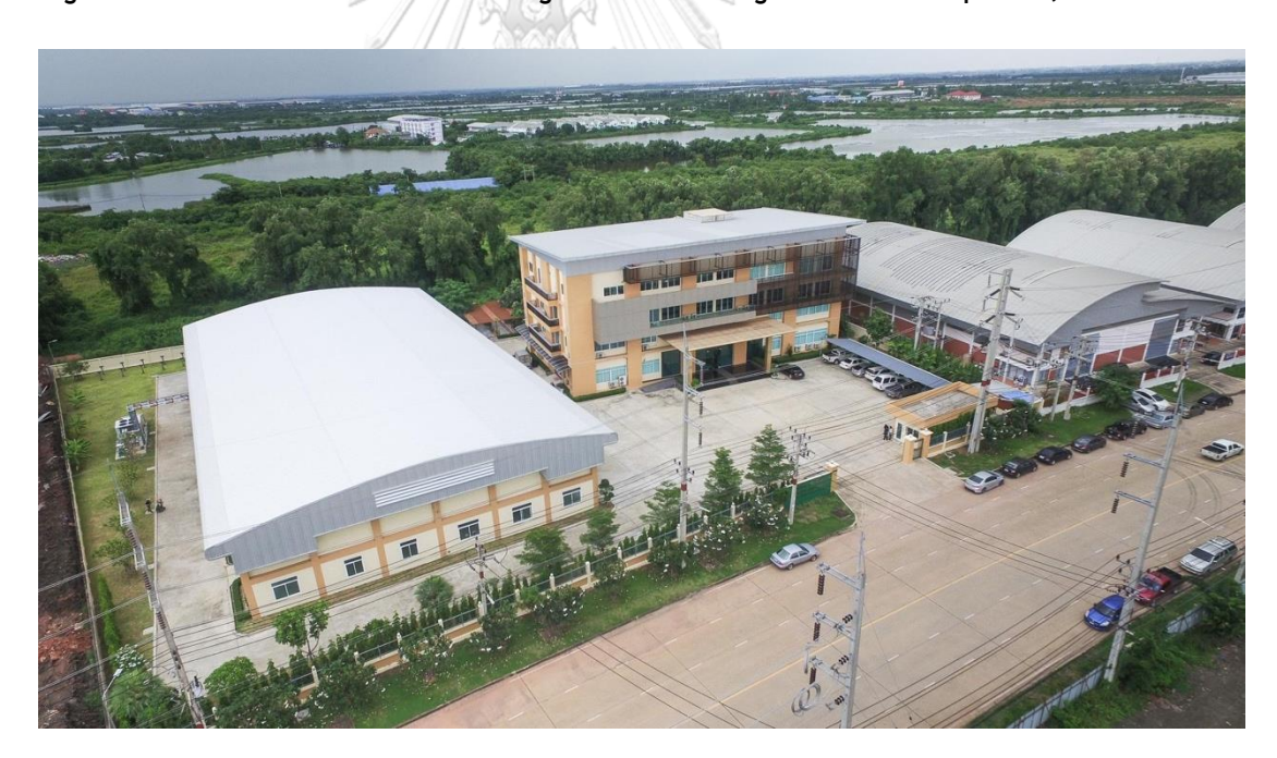
Figure 1.1 The outlook of the Jong-Thai Jianming Eiw Ea (Group) Co., Ltd.

4.1.1 The background of Jong-Thai Jianming EiwEa (Group) Co., Ltd.