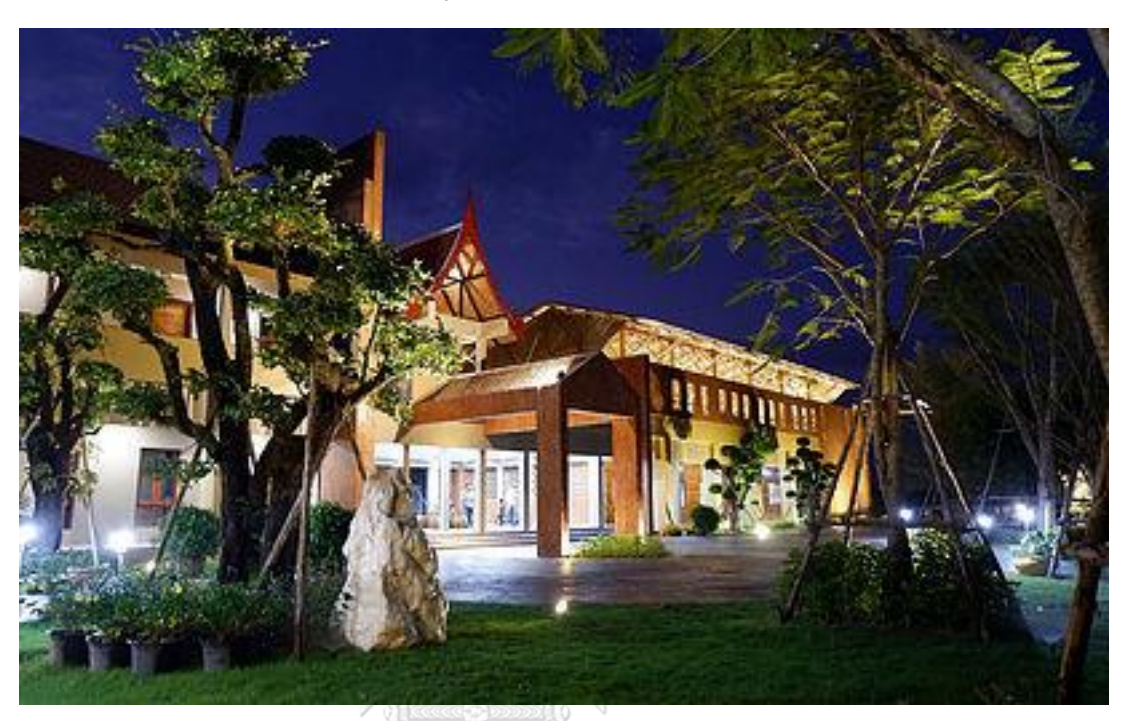
Figure 1.2 The outlook of the Ayutthaya garden-style healthcare tourism and preservation base