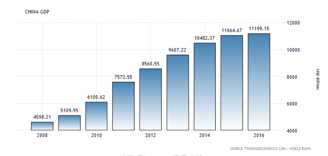
Chart 1.1: China GDP from 2008 to 2016

Besides, according to Fu Shaojun, who provides the export and import chart of China between 1978 and 2014, it can clearly be seen that the export rapid decrease after 2007 and turned back in 2009. This is due to the 2008 global economic risks as shown in Chart 1.2.