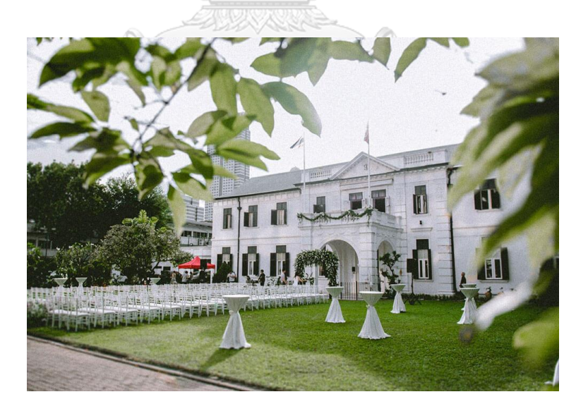
Figure 15: The British Club