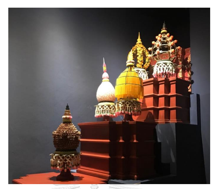
Figure 5: Lanna Worship Offering in Lanna Folklife Museum