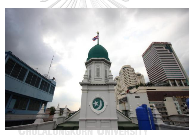
Figure 12: Ban Tuk Din Mosque