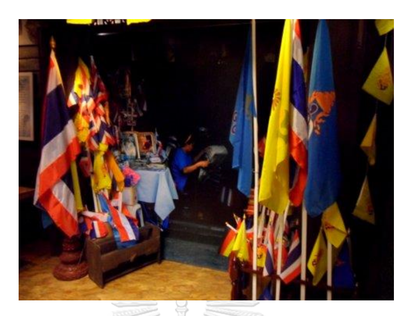
Figure 19: The exhibition of flag making skill in Bang Lamphu Museum