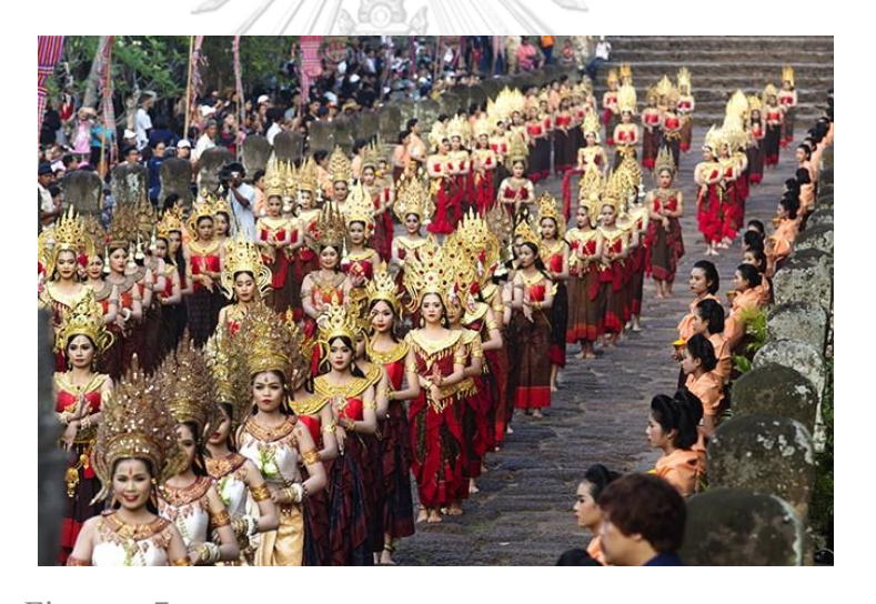
Figure 7: Phanom Rung Festival in Phanom Rung Historical Park

The participation of local communities in the forming of folklore museums and other safeguarding occasions can both benefits the community and the nation. Firstly, all the living intangible cultural heritage of the specific communities have functions to all members of the communities. The participation of local communities can fulfill the