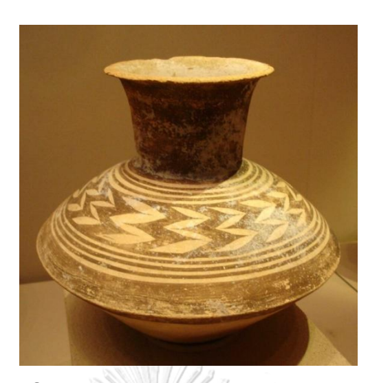
Figure 3: Ban Chiang Pottery in Thailand National Museum