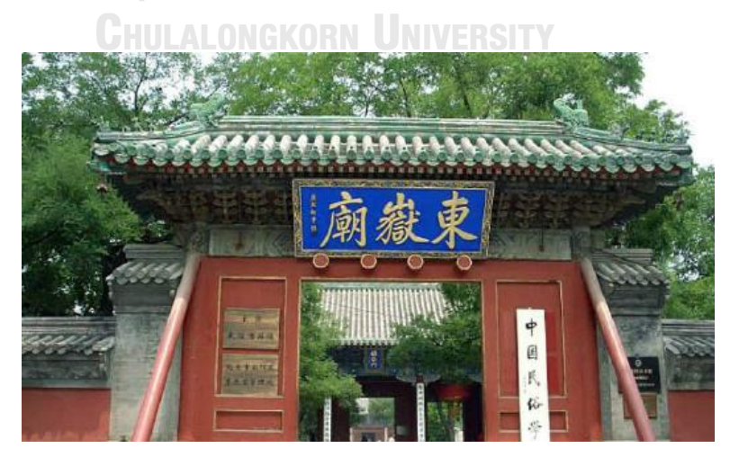
Figure 1: Beijing Folklore Museum, Beijing, China

of Chinese folklore in different ways. Daoism is the traditional ideology system original from China, the history of Daoism lasts for around 2000 years. Daoism as the folklore culture have been deeply influenced Chinese people's ideology, lifestyle and even personal character. Another example is the Museum Siam in Thailand. Visitors can observe, the influence of Theravada Buddhism as one of the most significant elements of the museum's displaying contents. To begin with the introduction to Theravada Buddhism's cosmology, the design concept of the Thai royal throne, Thai folk belief of "Nang Kwak" and so on. Theravada Buddhism deeply influences the forming and developing of Thailand through the nation's long history. As a result, in most of museums in Thailand, the contents related to the influence of Theravada Buddhism cannot be ignored. To compare Museum Siam and Beijing Folklore Museum, the different traditional religion and social contexts lead to the different outcome of displaying exhibitions.