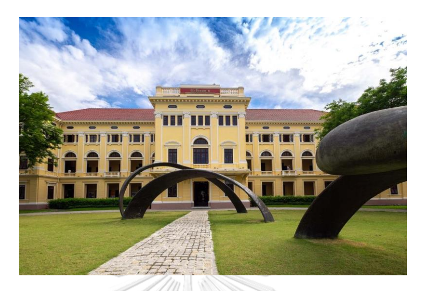
Figure 2: Museum Siam, Bangkok, Thailand