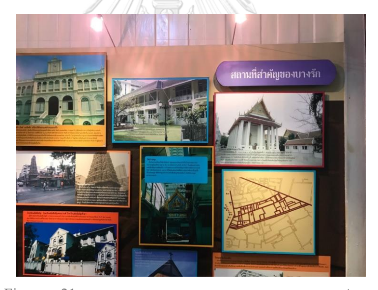
Figure 21: Exhibition section of Bang Rak Community on 2<sup>nd</sup> floor