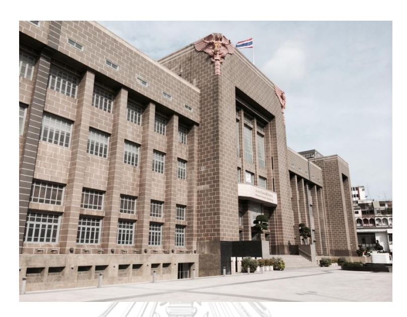
Figure 14: The Grand Postal Office