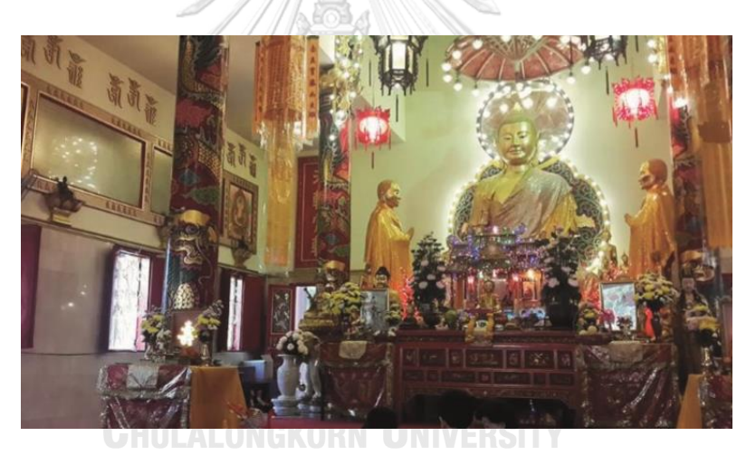
Figure 9: Wat U Phai Rat Bamrung Temple