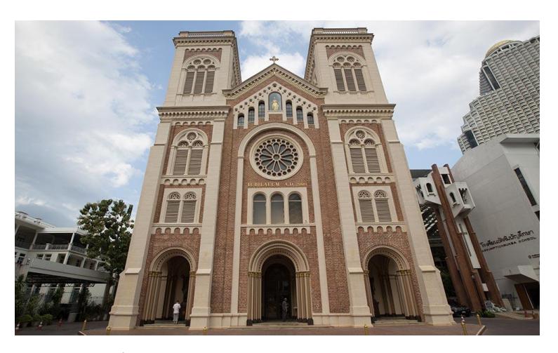
Figure 13: Assumption Cathedral Church

traditions and ethnical lifestyles as intangible cultural heritages. For example, the Hindu temple Wat Phra Si Maha Utama Devi located by the Silom Road, it was established by Indian immigrants during the reign of King Rama IV and it served as the religious center of Indian people in Bang Rak Community. Similarly, in Bang Rak area, it is not difficult to find Muslim Mosques (Bon Oou Mosque), Chinese temples (Wat Bamphen Chin Phrot) and of course traditional Theravada Buddhism temples. Despite compared to the other two historical communities, Bang Rak Community is the "youngest" one, the inclusive atmosphere maintains the cultural vitality of the community and its citizens. The conflict and negotiation between Eastern and Western reflect the cultural characteristic of the community, and the lifestyles formed in this context became the unique communal culture of Bang Rak Community. However, in contemporary Bangkok, Bang Rak as one of the main economic and business centers of the city is gradually losing its original residents who inherited traditional ways of life and has emotional connection with local community.