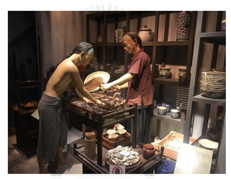
Figure 16: The Stimulation Sense of Sampeng Market in Yaowarat Chinatown Heritage Center

introduction, visitors can watch the documentary videos about the way of life of the representative local families. For example, one of the stories tells a third-generation Suatao family's life in Yaowarat Community, from their ancestor migrant to Sampeng as a labor to the young generation opened their own street food shop aside the Yaowarat Road.