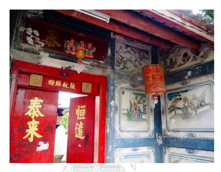
Figure 10: So Heng Tai Mansion

community. After the second time's resettlement and the expansion of the community, the original Sampeng Street now is known as Soi Wanit 1 and the old Sampeng neighborhood was also included into Yaowarat community. (Crawford 2000)