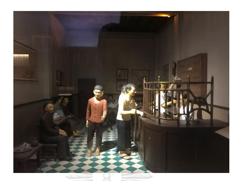
Figure 17: The Models of Traditional Chinese Lifestyle in Yaowarat Chinatown Heritage Center