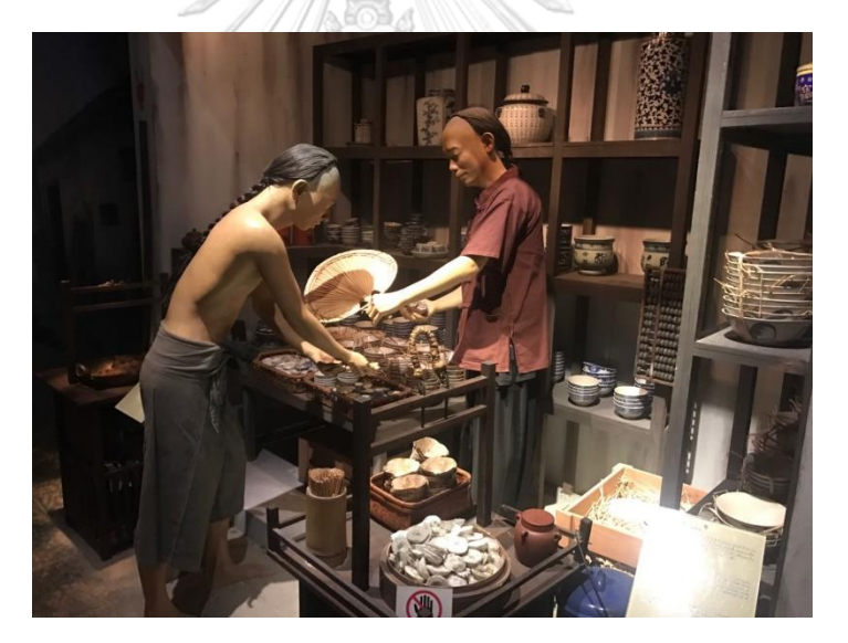
Figure 4: Exhibition in Yaowarat Chinatown Heritage Center

In this research, small-scaled folklore museums displaying the communal cultural heritages of specific communities are chosen to be study cases. Compared to other two higher levels of museums, roles of this type of museums in the preservation of