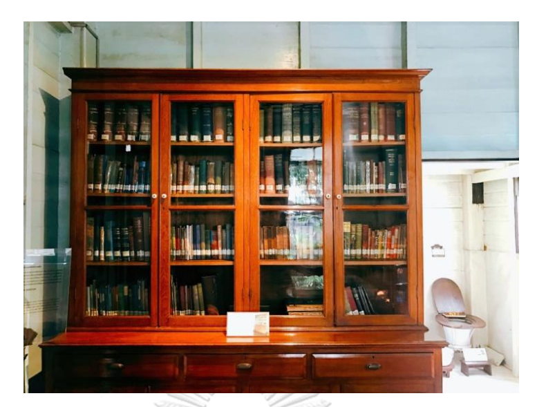
Figure 20: Exhibiting section in the previous Surawadee family house