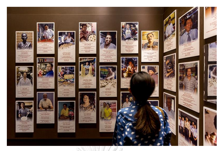
Figure 6: Exhibition of Community Members in Yaowarat Chinatown Heritage Center