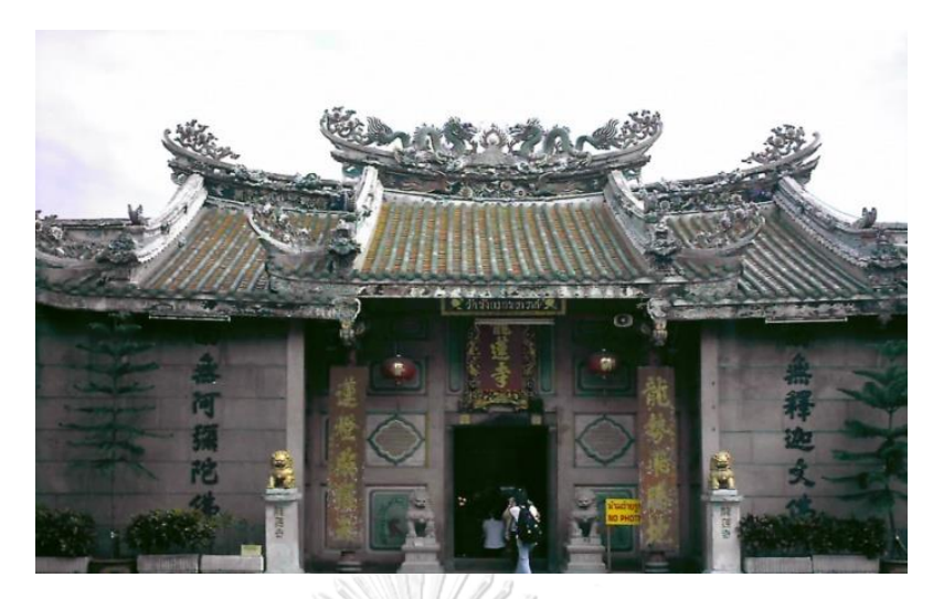
Figure 8: Leng Neoi Yi Temple