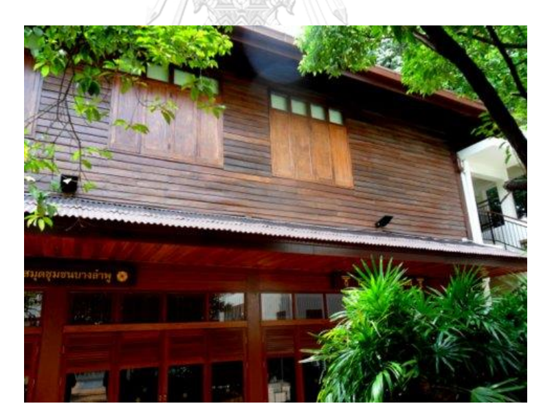
Figure 18: The wooden house of Bang Lamphu Museum

western lifestyles and ideologies influence the ways of life in Bang Lamphu community such as the establishment of the first cinema and music recording studio in Thailand, first train in Bangkok, the forming of Thai coffee culture and so on. In addition, another important concept that Bang Lamphu Museum tries to represent to its' visitors is that Bang Lamphu as a multi-cultural communities includes several smaller neighborhoods according to different origins, ethnics occupations or religions such as Laotian, Vietnamese, Khmer, Chinese, Muslim people and so on. These diverse cultures and intangible cultural heritage in some way share the same cultural identity as Bang Lamphu citizen as well.