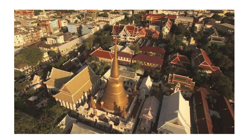
Figure 11: Wat Bowonniwet Vihara