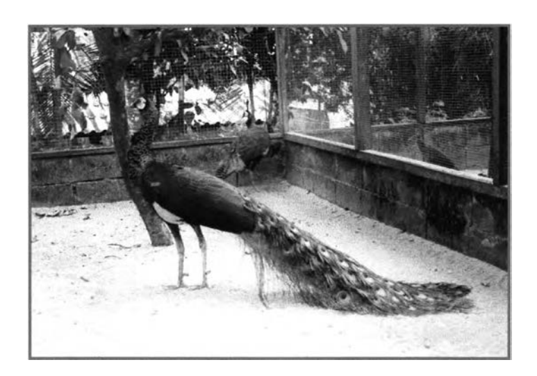
Figure 1.4 Green Peafowl ( Pavo muticus imperator) at Soi Dao wildlife research and breeding station at Chantaburi province