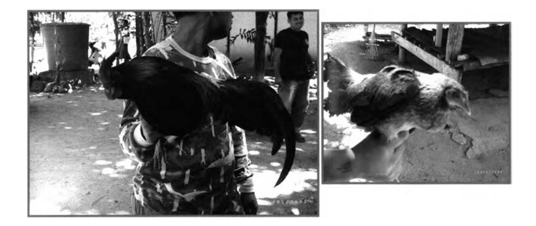
Figure 1.2 Red Junglefowl ( Galus gallus spadiceus) at Satun province

Red Junglefowl is found in South-western Yunnan, Burma, Thailand (except extreme east), northern Laos, Malaya and northern Sumatra. Integrades with jabouillei , gallus , murghi and bankiva near their respective boundaries. It is probable that the world's domestic pcultry originates from this species alone and therefore of all birds the Red Junglefowl has been of unrivalled importance to mankind.