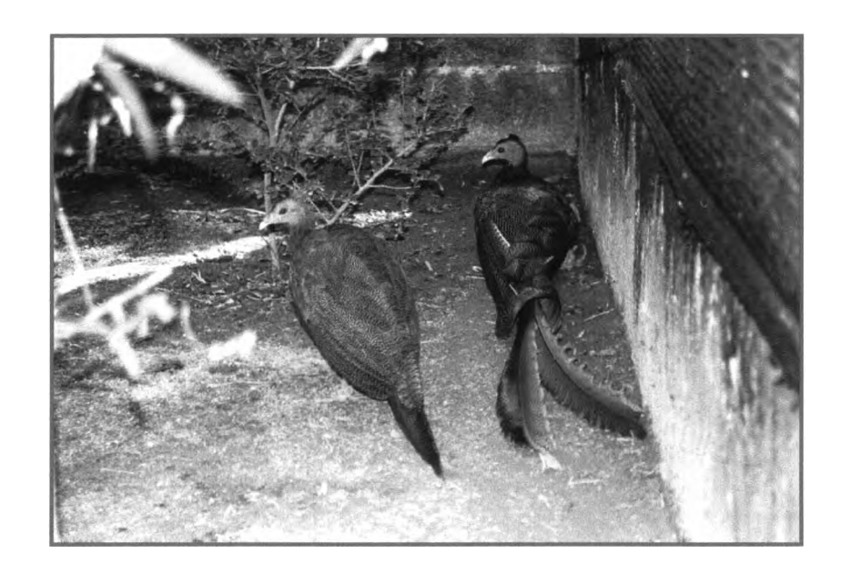
Figure 1.1 Malay Great Argus ( Argusianus argus argus ) at Soi Dao wildlife research and breeding station, Chantaburi province photographed by Miss Sudthida Sudhtharmvilai.