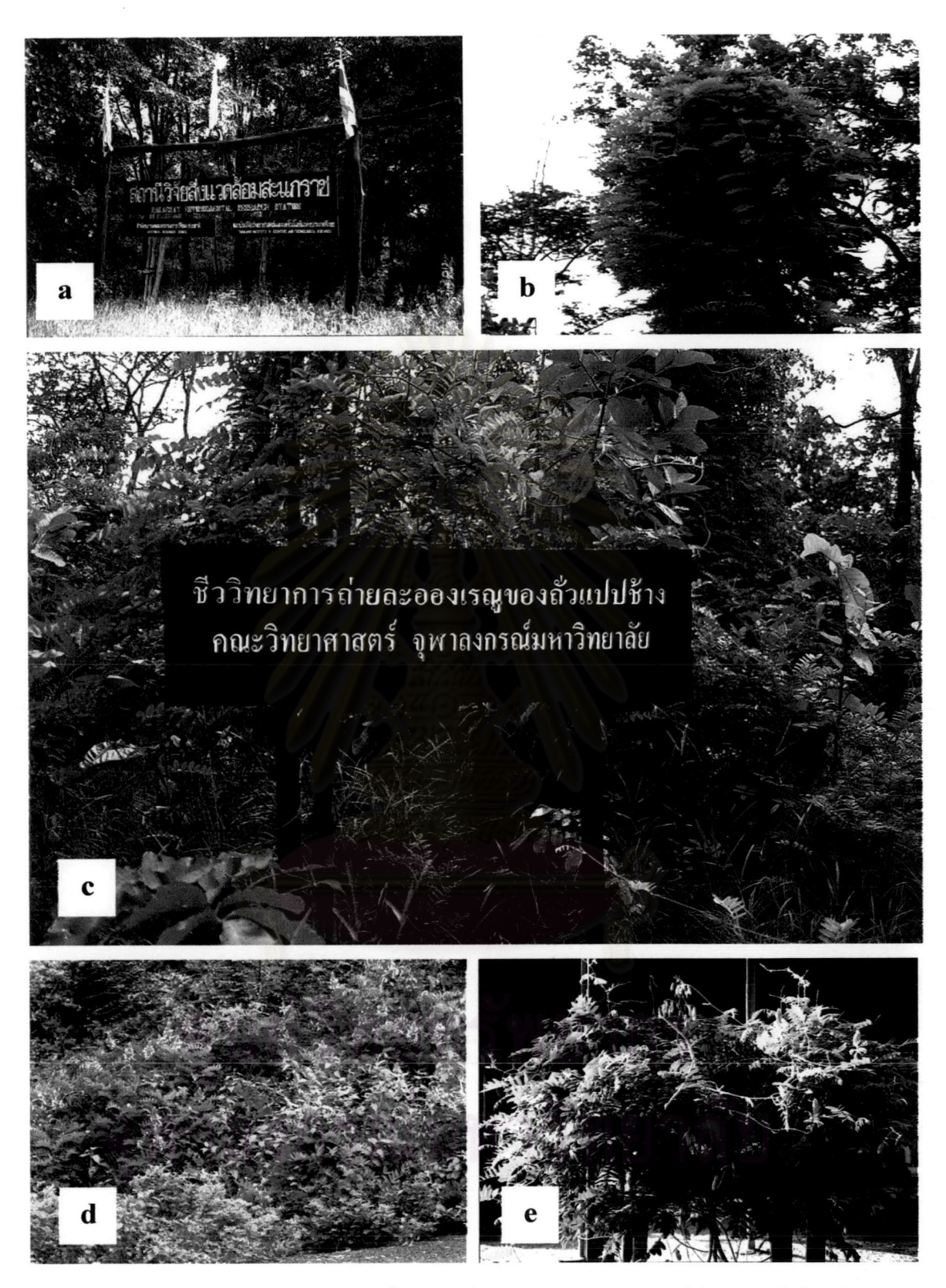
Figure 3.3 Some of study sites: a , b , c , Sakaerat Environmental Research Station (SERS); d , Phanom Rung Historical Park; e , Pharphayom District, Phatthalung Province.