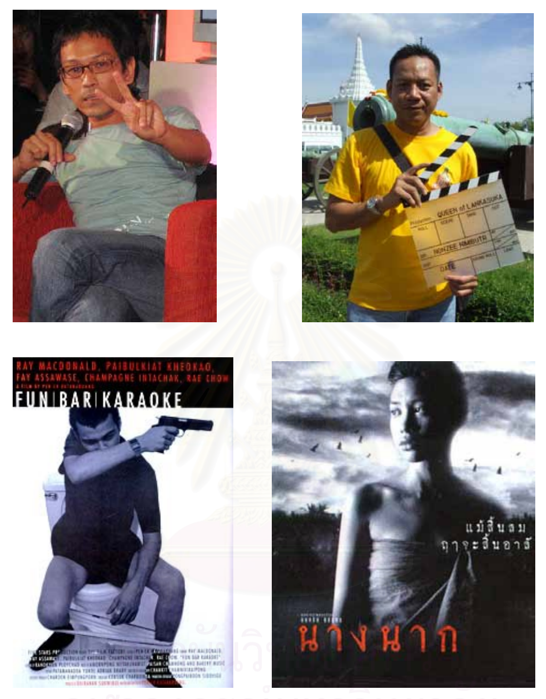
Photo Beneak Ratanarung's "Fun/Bar/Karaoke (1997)" and Nonzee Nimibutr's "Nang Nak (1999)"

This commercial and international award has broken down the traditional mold of Thai films. They have sought new faces and treated contemporary themes with frankness; avoided complicated and irrelevant subplots; discarded comedy and violence when not relevant to the story line and used improved editing and