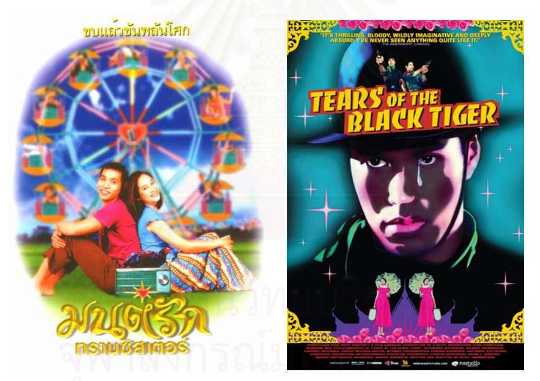
Photo "Monrak Transistor (2001)" and "Tears of the Black Tiger (2000)" Poster

As the result of that, opportunities for young filmmakers expanded. However it was still very difficult for independent director to find money or sponsorship for independent or experimental films, unless they have already gained the international recognition at the certain level like Apichatpong Weerasethakul. Nevertheless, a growing film culture grounded in university film courses and local film festivals fostered an upsurge in creativity which saw young Thai directors learning how to blend Thai stories with techniques borrowed from the world cinema to create locally relevant films that could appeal to overseas audiences. Thus "Monrak Transister/Juuศ์รัก ทรานษิสเตอร์ (2001)" and Wisit Sasanatieng's "Tears of the Black Tiger/ฟ้ากลายโอร (2000)" took aspects of Thai culture, popular music and cinema, and gave then a playful postmodern spin which found an appreciative audience across Europe and America.