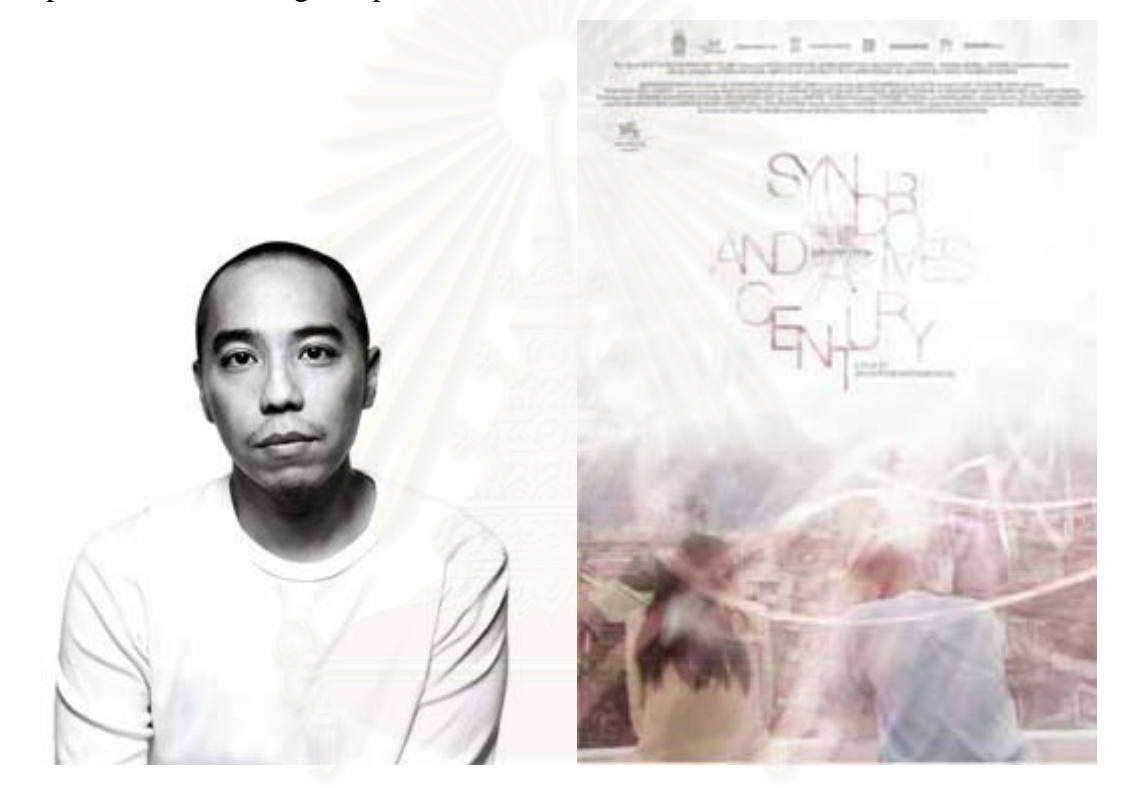
Photo Apichatpong Weerasetthakul's "Syndrome and a Century (2007)"

The debate over film censorship system became a new debate in 2007 when the award-winning Thai film "Syndromes and a Century/แสงสรรดวรรด" missed its local debut in Thai theatres because Thailand's board of censor insisted on cutting the four sensitive scenes. They are the scenes of (i) a Bhddhist monks playing guitar (ii) two monks playing with a remote-controlled flying saucer (iii) a doctor kisses his girlfriend in a locker room and (iv) a group of doctors drinking whiskey in a hospital basement. Therefore Apichatpong Weerasetthakul, the film's director has decided to skip the local screening and push the film to screen aboard instead.