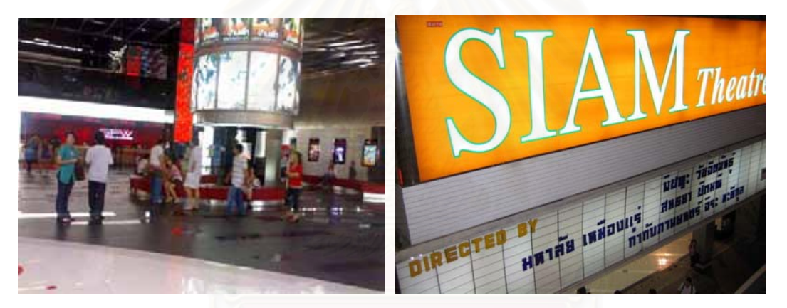
Photo the multiplex "SF world cinema" and surviving stand alone cinema "Siam Theatre"

Nowadays there are hardly any more stand-alone movie theatres (the one that still exist such as Lido, Scala and Siam theatres at Siam Square). Most theatres are incorporated in small shopping arcades, or bigger shopping centers. There are a couple of movie theatre chains in Thailand. The largest cinema group is the Major Cineplex Group, which is a merger of EGV and Major Cineplex. Another group is SF Cinema City Organization, which operates SF Cinema City complexes in Bangkok (including SFX Cinema at Emporium Shopping Center). SF Cinema City also operates under the name SF Multiplex. SF Central World Cinemas (at Central World Plaza) also belong to this group.