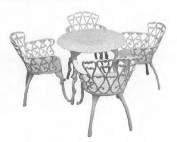
Figure 1.2: Flamingo garden set