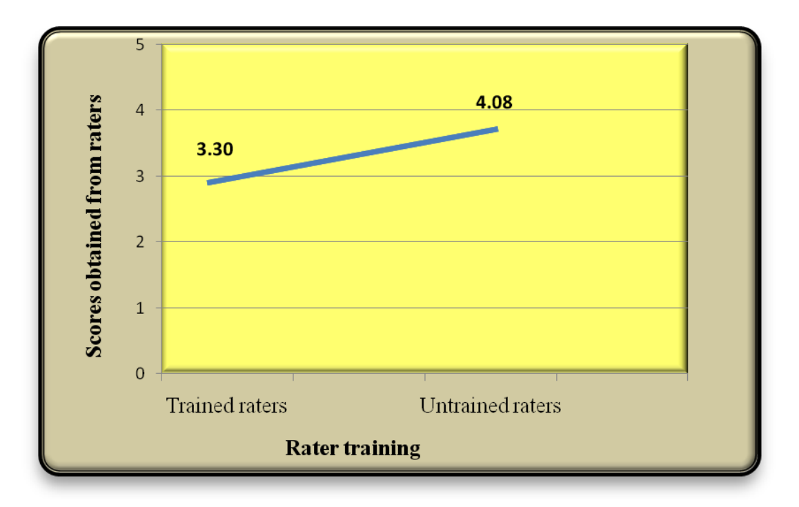
Figure 4.2: The effect of rater training on raters' decision-making in rating the speech sample no.3

The finding shows that the raters' decision-making in rating the speech sample number three is able to distinguish between trained and untrained raters. It can be seen from Figure 4.2 that the raters who had not been trained seemed to be more lenient in rating the speech sample no.3 than the raters who had been trained. The mean of the former is 4.08, while that of the latter is 3.30.