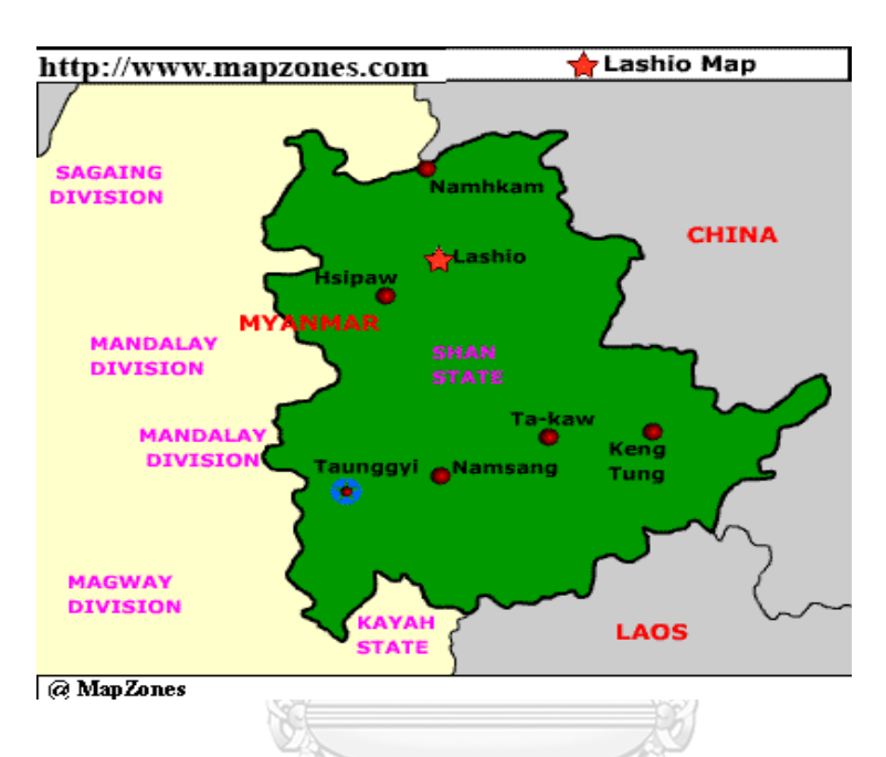
Figure 1Site location of Lashio in Shan state

The drug dependents, the local community and the service provider wisdoms that are living in Lashio Northern Shan state (see Figure 1: for site location) will be the targeted demographic and geographical objective for this research.