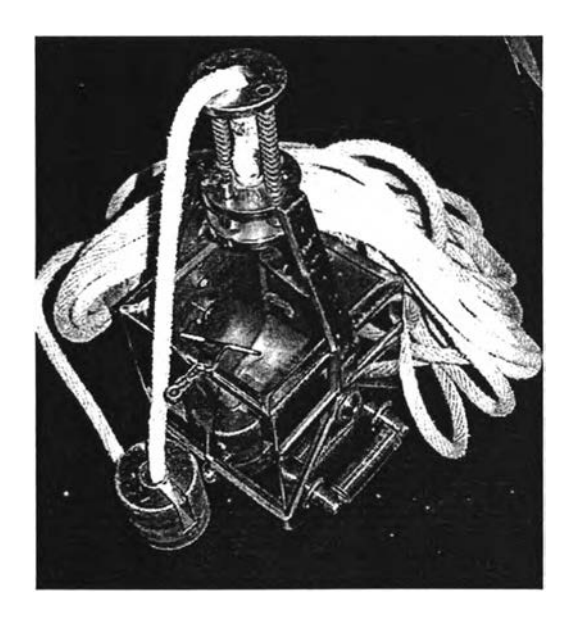
Figure 3.1 Stainless steel grab used as sediment collector.

Petroleum hydrocarbon contaminated surface sediments were collected in the level of approximately 3-4 meters under the water by stainless steel grab sampler as shown in Figure 3.1. Samples were kept in dark bottle at 4°C until used. The sampling sites in this study are listed in Table 3.2.