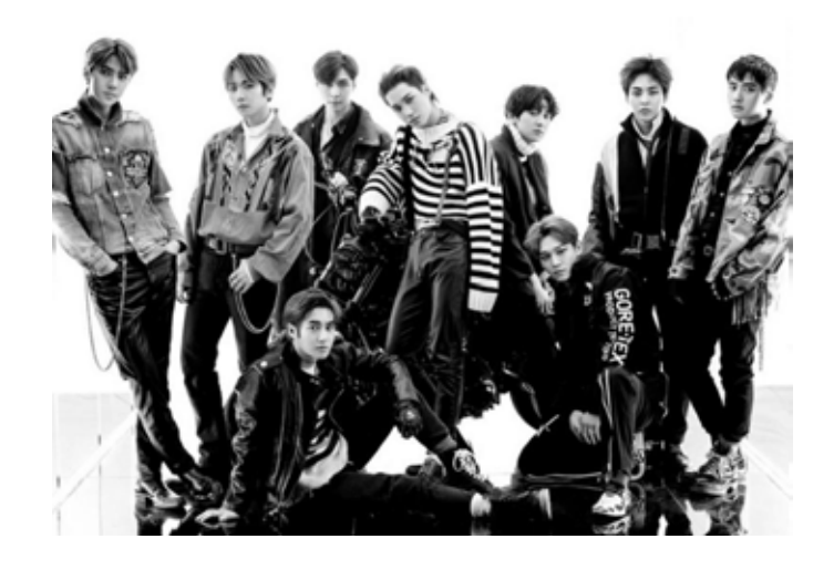
Figure 5: Korean Popular Boy Band "EXO (2012)"