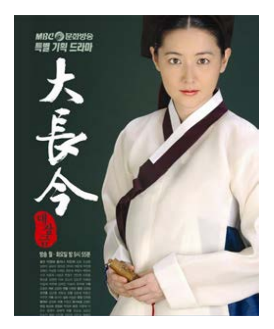
Figure 6: Korean Popular Drama series "Dae Jang Geum (2003)"