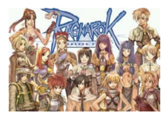
Figure 4: Korean Popular Game "Ragnarok Online (2002)"