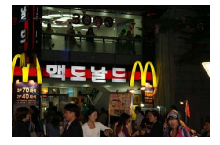
Figure 2: McDonald (American Fast Food) in Seoul, Korea

culture that they perceived as improvements over what their native cultures offered" (Seong Won Park, 2009).