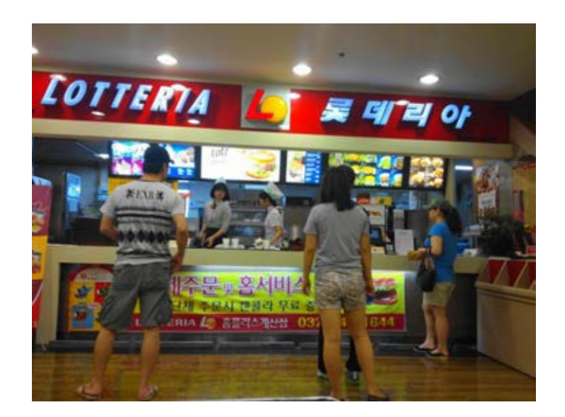
Figure 3: Korean Fast Food brand "Lotteria"