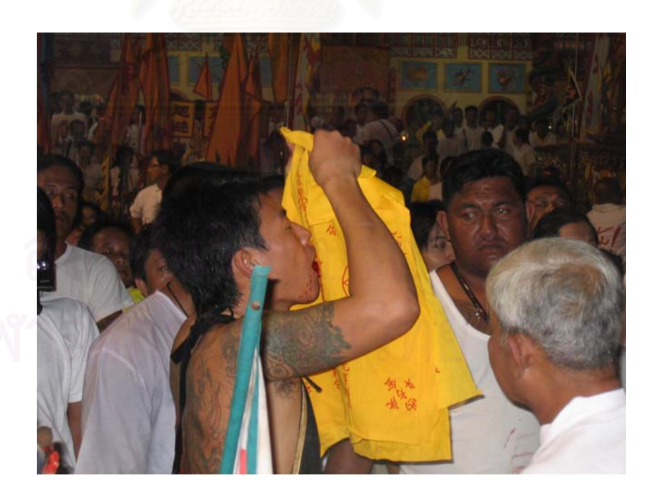
Picture 12: The spirit medium is touching the yellow incantation with his blood.