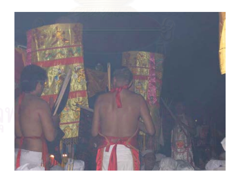
Picture 2: Two incense urns, Yok Ong and Kiu Ong, with ceremonial umbrellas.