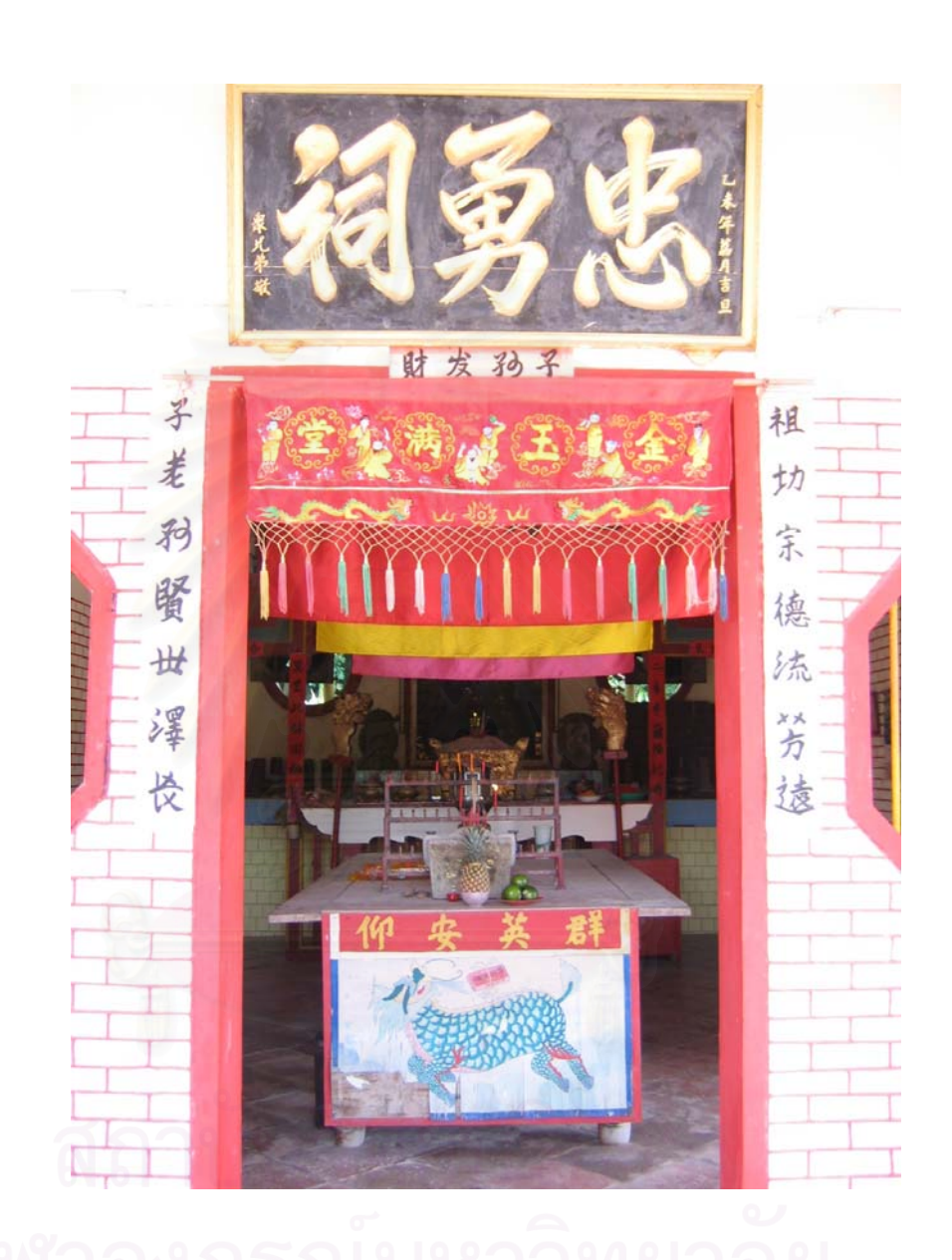
Appendices 1: Tong Youg Su Shrine in Kathu, Phuket, Thailand.