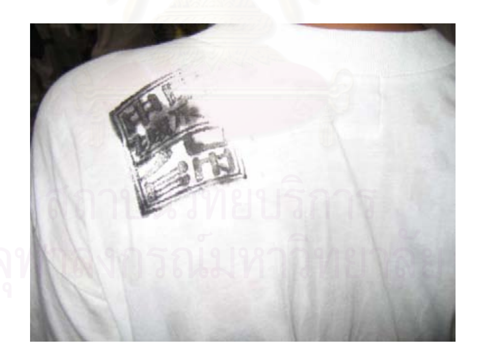
Picture 17: After crossed the bridge, the devotees will be stamped on the cloth.