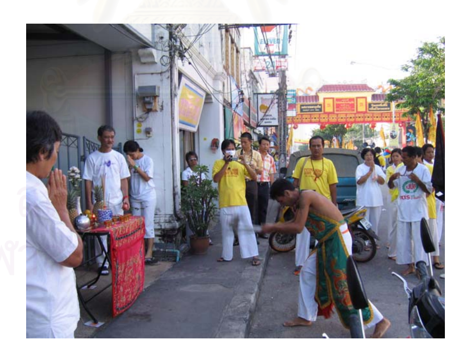
Picture 9: The spirit medium is showing body harming to revere the family god.