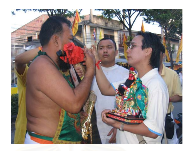
Picture 22: The spirit medium and Phi liang (the spirit medium's assistance). Look at apron of god statue and spirit medium is the same.

The mediums play the leading ritual roles in the festival. They are representatives for the gods and spirits to conduct the ritual. According to the "master narrative" of Chinese folk theology, people who suffer the misfortune of a weak astrological configuration or one which bodes ill, and are therefore destined to die young, will tend to become spirit mediums. However, informants on Phuket Island put this relationship in more concrete terms; they claim that people who have been sick and in danger of dying, would become mediums of a deity, and thereby save or extend their life.