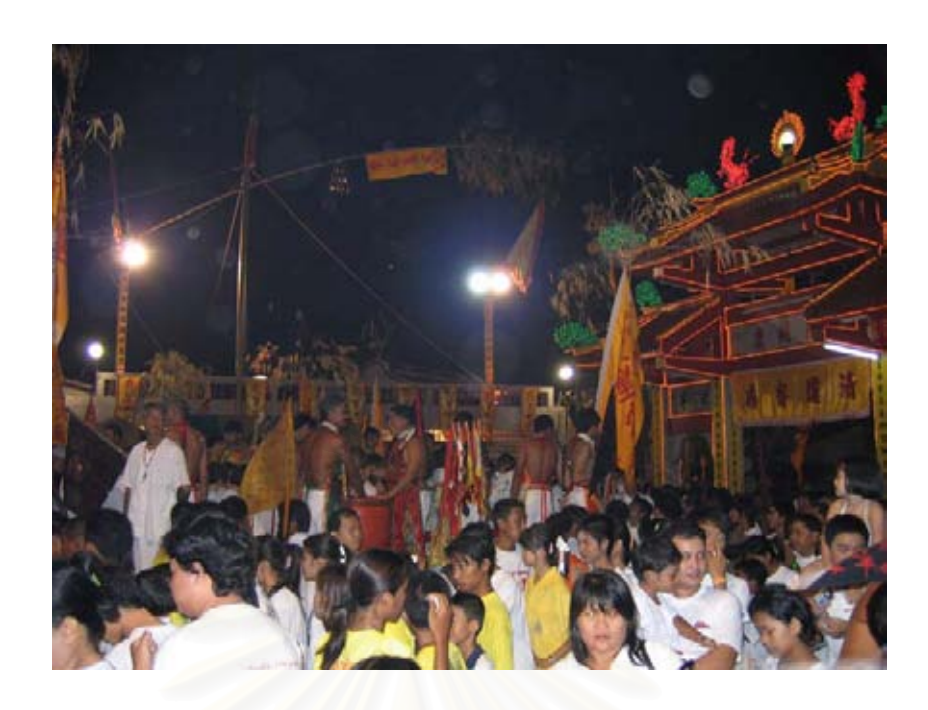
Picture 16: The public has queue for crossing the bridge in order to good luck in the future.