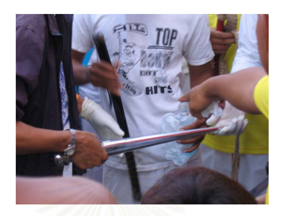
Picture 6: A tool for piecing the spirit mediums cheek before put the object.

Then the processions of each Chinese shrine consist of Kiu Ong and Yok Ong incense urn with the ceremonial umbrella. The person who holds the incense urn is a priest's assistant [lochu], deities' statue with the sedan chair have four holders for each, lots of spirits medium and follow a vehicle of the shrine association followed by school children carrying banners with the name of the shrine, and flags and banners with the written names of the goddesses in Chinese characters. During the way, the public will throw fire-cracker to deities' statue in order to celebrate and represent happiness of the devotees.