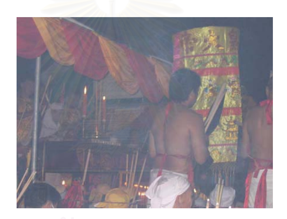
Picture 19: Huat Kua is reading Taoist prayer to send Kiu Ong back to the heaven.

When the processions reach the Saphan Hin sea shore, the huat kua reads a Taoist prayer and then the sedan chairs of the gods and the incense urn of Kiu Ong and Yok Ong are brought to the water. At the same time, the public are waiting for the processions. While Taoist prayer is praying they lights the incense sticks. Then they burn gold paper that they prepare. After that all the spirit mediums come out of the mediums bodies. On the shore, the pile of gold paper is burned. This ritual that I observe there is no western visitor come. Most of participants are local; they wear white clothes and come with their family or their group of friends.