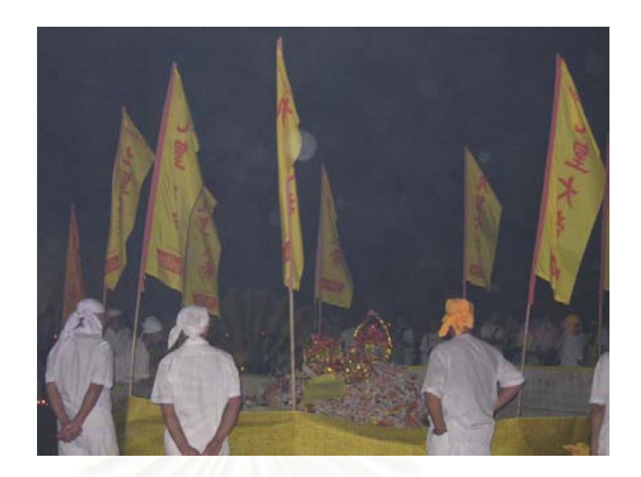
Picture 20: Gold paper heap, it will burn after brought the incense urn of Kiu Ong and Yok Ong to the sea.