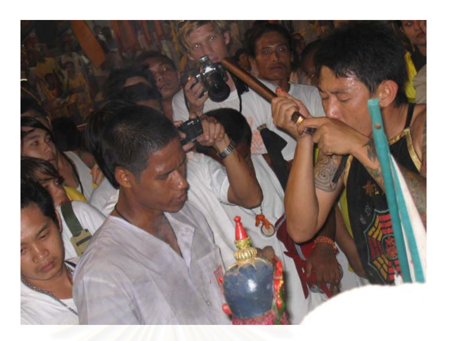
Picture 13: The spirit medium is cutting tongue slightly for getting blood to touch with the eyes and forehead of new images of gods.