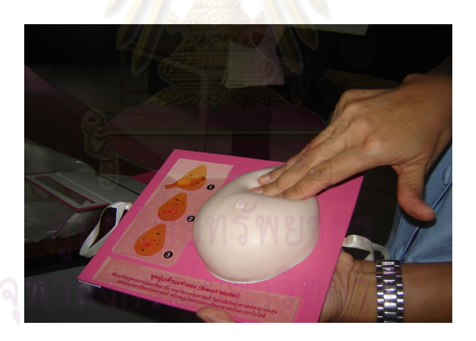
Silicone Breast Model by Chulalongkorn University