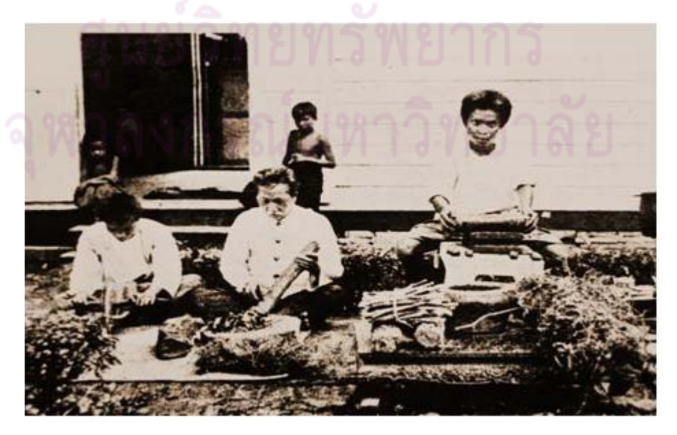
Fig. 1 Traditional healers prepared herbal medicine using local wisdom, a mixture of herbs.

The integration of modern and traditional medicine in the Thai society has continued until today. Since the time of His Majesty King Rama 4, modern medicine has outgrown traditional medicine. However, the practices of traditional remedy still creep into the way of life of many, even the education. Such practices have been influenced by traditions, culture, social beliefs in the popular sector, folk sector and traditional sector. Many still believe that sicknesses result from a failure to obey the rules of nature, disrespect for the spirits of the land, and imbalances between the elements. Many still believe that when the ancient world lived in simplicity, "yin" and "yang" works harmoniously. Many have sought the advices of astrologers and fortune tellers to plan for their livelihood. With the introduction of germs theory, biological and behavioral determinants of diseases, immunology, and receptors targeting for cancers, and gene therapy, modern science has greatly improved our understanding of health and diseases. However, it is still the patients and the public who make the first choices to cope with health and diseases. A full understanding of modern medicine and people's practices is essential to bring about cost effective care for individuals and the society.