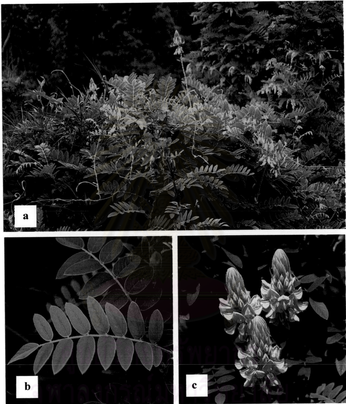
Figure 1.1 Afgekia sericea Craib: a , natural habitat at Sakaerat Environmental Research Station (SERS), Nakhon Ratchasima Province; b , compound leaves; c , inflorescences.