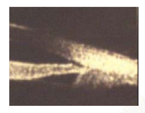
Figure 6. Plateau iris configuration was shown by UBM after laser iridotomy had been performed.

Additionally, the followings should also be brought into consideration: