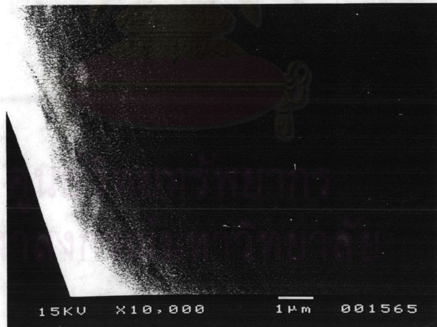
Figure 14 Scanning electron microscope of ethylene vinyl acetate copolymer containing 9% vinyl acetate.

The transdermal patch used in this study was prepared using impermeable backing membrane of heat sealable tan polyester film laminate. The membrane was obtained from non porous ethylene vinyl acetate which contain 9% vinyl acetate content. Scanning electron microscope can be observed in Figure 14. Ethylene vinyl acetate with vinyl acetate content less than 10% is not visibly attacked or dissolved by nicotine (Baker, et al., 1990). The adhesive layer of the system was hypoallergic acrylate pressure sensitive adhesive. The delivery device was protected using a release liner (Figure 15). Preparation of transdermal patch was cut backing membrane and EVA copolymer membrane into pieces (3.5 x 3.5 cm each) and sealed four rim with heat sealer. The system is square, multilaminate, which is then delivered across the rate-controlling membrane to the skin. A system with a contact surface area of 9 cm 2 and have a total nicotine content of 22.5 mg (2.5 mg/cm 2 ) was used in this study.