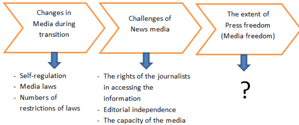
Figure 1: Conceptual Framework

The concept of this research is to examine the extent of press freedom that media professionals in Myanmar are enjoying due to the changes from media after country's reform. Through in-depth interviews and data analysis, we can see how media in Myanmar adapt to operate as the regime moves from authoritarian military government to quasi-civilian government. The challenges, in terms of the capacity of Myanmar media, the rights of the journalists to access information, and the situation of editorial independence are taken into consideration while observing how media has changed during the transition period. Through the perspective of editors and journalism trainers, the capacity of the media under which the need for human resources and the difficulty in finance resources will be discussed as a challenge that media houses in Myanmar are dealing with. Also, the rights of journalists to access information and editorial independence from the perspective of the reporters and editors of media houses will be discussed in order to assess the challenges of the press freedom to private news media in Myanmar face.