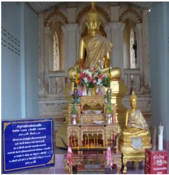
Figures 2.1-16, 17 Phra Seum replica in Wat Sikhert