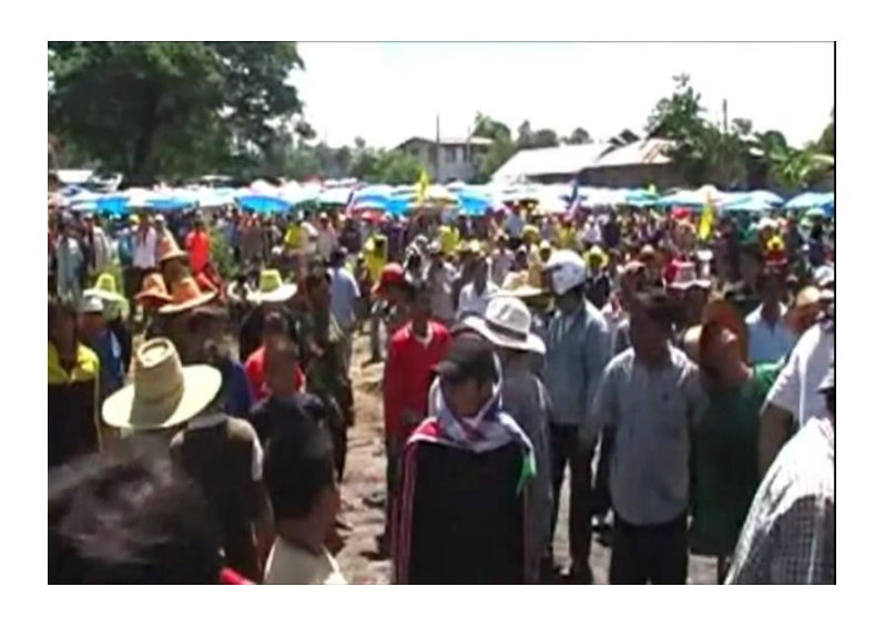
Figure 3.1.4-1 The local villagers participate in the Rocket festival

However, the festivals offer an excellent chance to make merriment before the hard work of agriculture begins; as well as enhancing communal prestige, and attracting and redistributing wealth as in any gift culture. The Thai government, the Tourism Authority of Thailand has helped promote this event. Some days before the ritual, there were the preparations when the money is collected from every household in the villages for buying black powder to make the rockets and related materials or things such to rent the music bands, Mor Lam Sing for merriment.