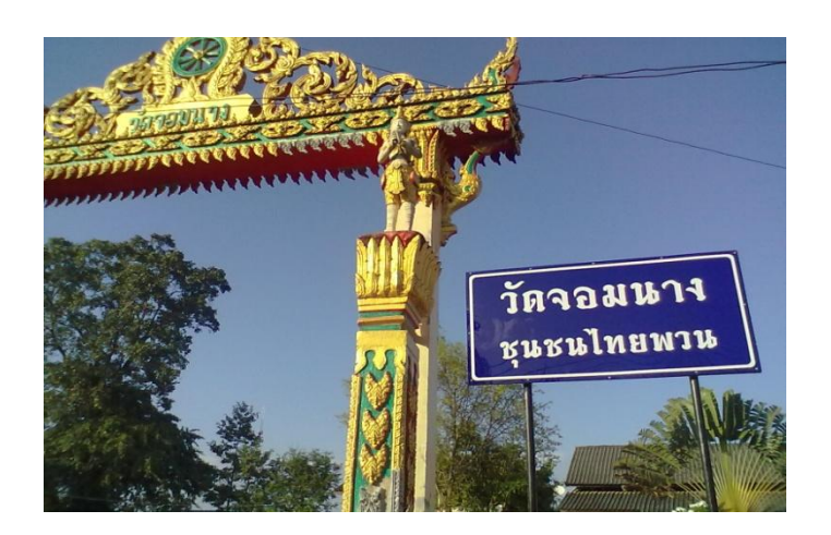
Figure 2.1- 1 Thai Phuan Community at Wat Chorm Nang temple

At present, a Thai Phuan community is found in Mooban 333, Thanon Phisaisorndet, Tambon Chorm Phon, Amphoe Phon Phisai, Changwat Nong Khai, three kilometers from Wat Luang Village.