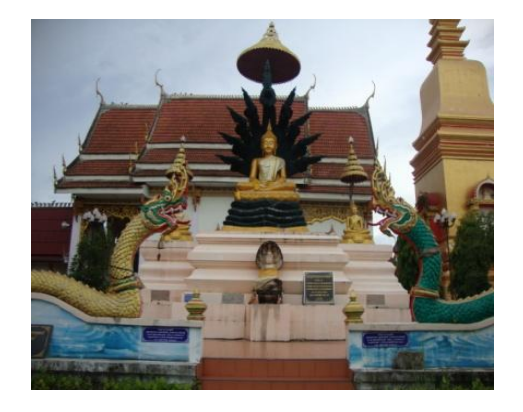
Figure 3.1.1- 7 Naga image with 7 snake heads cover Buddha in Wat Luang temple

One of the notable Nagas of Buddhist traditions is Mucalinda, who is the protector of the Lord Buddha. In the Vinaya Sutra (I, 3) the Buddha shortly after his enlightenment was meditating in a forest when a large storm happened. To comfort the Lord Buddha, a liberal Naga, King Mucalinda gave the shelter to the Lord Buddha by covering his head with his 7 snake heads. The Naga is also believed to be a rainbow or bridge that connect human to heaven realm.