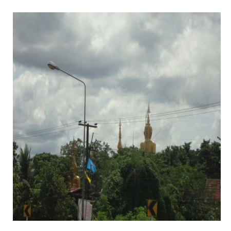
Figures 2.3.1-1, 2 Great Buddha statue in Wat Luang temple