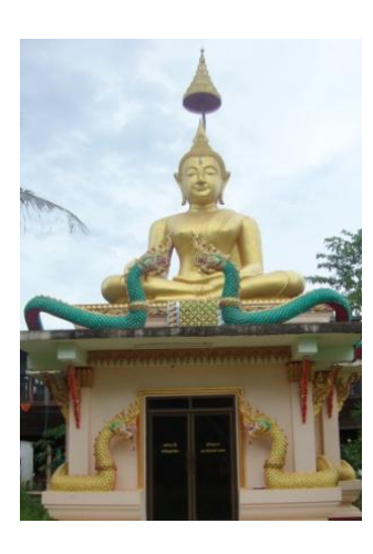
Figures 3.1.1-1, 2 Naga image in Wat Luang temple