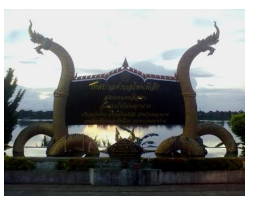
Figures 3.1.1-4, 5 Naga image in Wat Thai temple, Phon Phisai