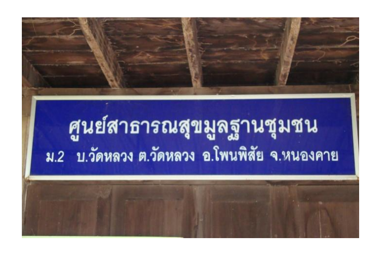
Figure 2.3.5- 1 Wat Luang basic halth care

However, in the village there are persistence of folk medicine services as the spirit practitioners, Cham, Moh Doo, and Moh Khwan who are holding spiritual clinic as traditional curing systems for those who need their services. It seems certain that even though the local villagers have adapted and accepted the modern medical sevice but they are still have confidence in the spirit practitioners for their skill confronting supernatural forces that allegedly cause illness and misfortune (Luoi, 1988: 437). In their work of curing illness, Wat Luang spirit practitioners are also open for people outside the village. Apart from going to receive modern medical facilities, villagers also always seek assistance from the spirit practitioners. Moh Khwan would provide ritual to comfort the people's minds and give the herbal medicines for patients. Moh Doo and Tiam would conduct the healing rituals concerning health problems cause by unseen being. They are said that the cure of especially mental illness is possibly success.