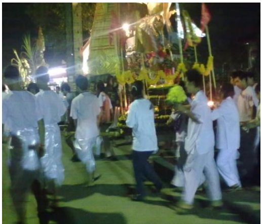
Figures 3.1.2-8, 9 Bong Soung ceremony in Wat Luang temple

It is mysterious fireballs which come up from the Mekong River and seem very difficult to prove of the phenomenon whether how can it happen and why it happens only on the full moon night of the end of the Buddhist lent day even this day is different in each year. Other questions, why it happens only in the particular areas of Wat Luang, Phon Phisai District and areas nearby? Why do the fireball have no sound, no smoke, and don't fall down to earth?