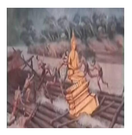
Figures 2.1- 6, 7, image painting in Wat Luang temple follow the legend of Luang Phor Phra Suk

In 1993, people organized a rite to propitiate the moral of Luang Phor Phra Suk who drowned in the Mekong River in Wat Luang Village, Phon Phisai District to rise up and gold melting replica Luang Pho Phra Suk at Wat Luang temple. In the stupa place Phra Suk replica has some water flowing from shaft all year. No reason, where water came from, the temple renovated the stupa and spent over 100,000 Thai Baht but the water still flowing. They said that it has a young serpent taking care of water so that the water drops all year.