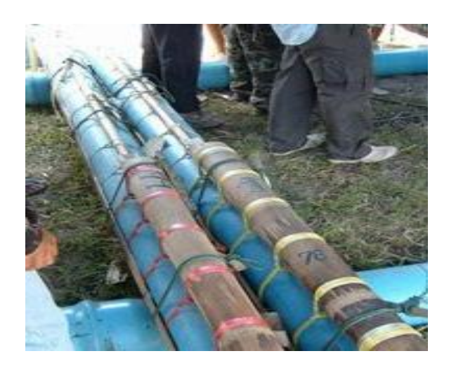
Figure 3.1.4- 2 Rockets

On the first day of the festival, every household prepares foods and drinks such fermental rice noodles ( Kanom Chin or Kao Pun in local language) and beer to welcome the invited guests who are their relatives and other villagers around. At night the Mor Lam Sing, a type of morlam that is very popular among the local Isan-Lao population perform all night and the locals have great fun. Outsiders have a hard time understanding the humour, which is often rather bawdy.