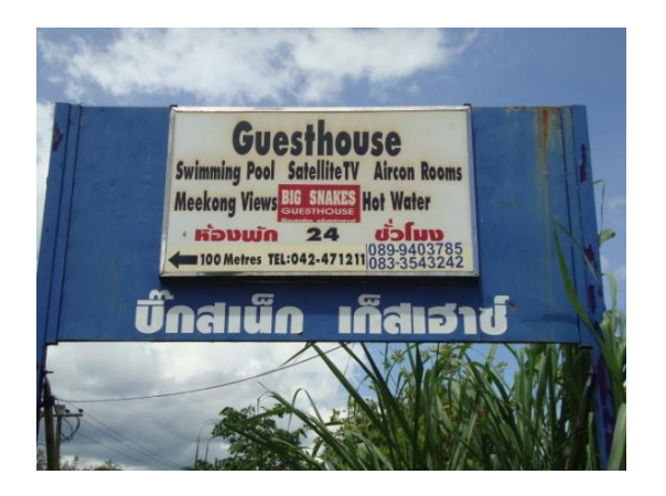
Figure 2.3.3-1 Guesthouse in Wat Luang village