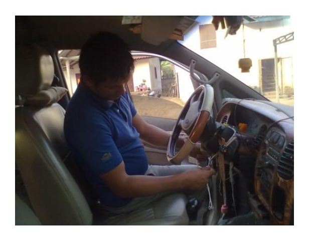
Figure 3.4.1- 4 The sacred strings are tied under the wheel

The thread is worn by an individual normally for a minimum of three days and is untied thereafter (thread is not be cut). Recommended practice is to allow the thread to fall off on its own especially for the vehicles that the strings always has small currency note tie up under the wheel.