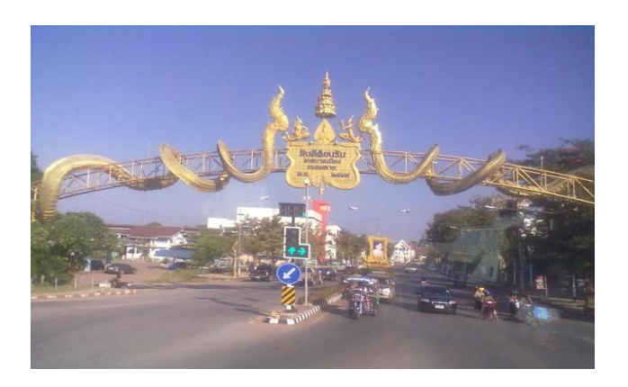
Figure 3.1.2-12 Naga symbol of Nong Khai town