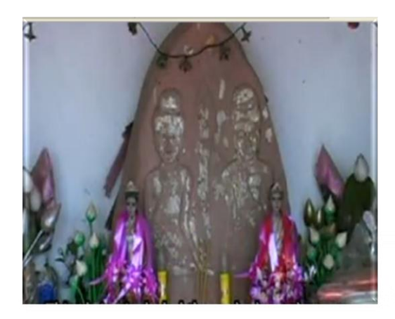
Figure 4.3.1-1 Chao Mae Song Nang statue at Hay Sok temple

To trace back the ancient Thai custom and culture there is a stone of Chao Mae Song Nang statues at Hay Sok temple which said to be a relic left and it is very useful evidence for us to study related to the regional historical context. Besides being a valuable treasure, it is one of the most important historical evidences of Isan- Lao connections as well of which Wat Luang villagers were aware that they are also the descendant of Chao Mae Song Nang.