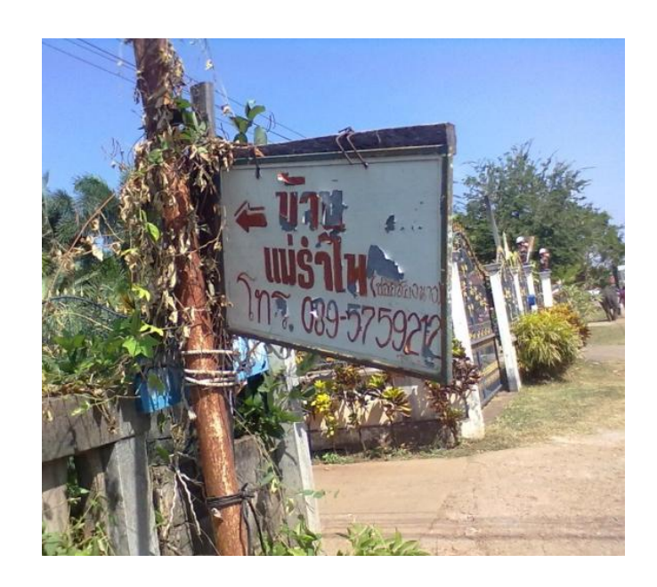
Figure 2.3.5- 2 A sign showing the direction to Mae Ramphai ( Moh Doo )'s house