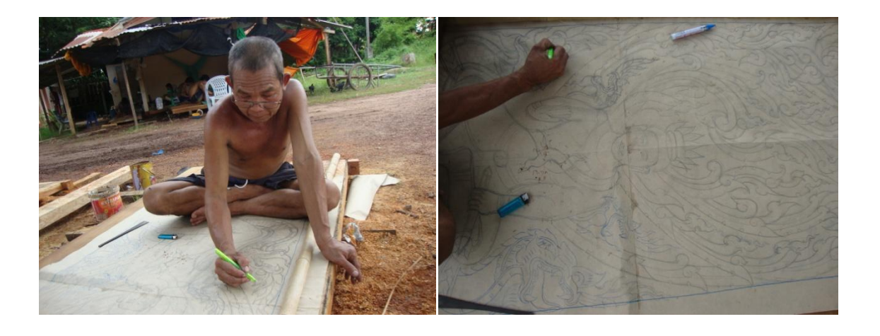
Figures 4.3.1- 2, 3 The Local carpenters with coworkers carve the door for Wat Luang temple hall

The spirit practitioners themselves such as Moh Doo, Moh Khwan, Tiam also would get the compensation from their performing the rituals or cervices. Some local villagers have works in the local Naga pure drinking water factory, Big Snake Guest House, and even Spirit House Shop by create spirit houses and sale, while the carpenters create the jobs of carving the images of the principles of the beliefs to decorate or in the work relate to the construction of the local temples.