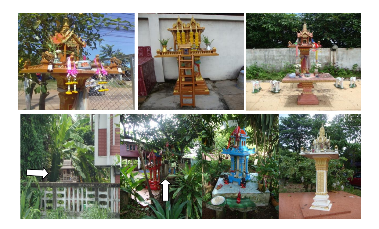
Figures 3.3- 1-7 The Guardian spirits or spitie houses in house compound of the Wat Luang villagers

In generally, Phra Phum is the ruler of the place, the presiding spirit of the area. Phra Phum derives from the word Bhumi , which stands for earth in Pali and Sanskrit languages. Chao Thi means the owner of the land in Thai. Phra Phum is only one of the vast pantheon of spirit that rule the Thai universe. He belongs to the psychic realm the Thai designate as Decha, realm of chaos far from the safety of home, temple where potentially destructive power roam at will causing illness, loss, death, or harm.