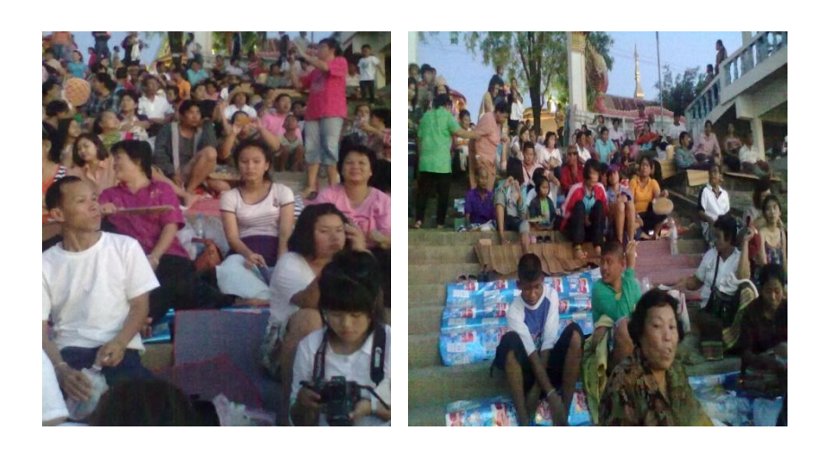
Figures 3.1.2- 1, 2 The people were waiting to view the Naga fireballs

served with Music and Miss Naga World 2012 Contest were helped in Phon Phisai town. During the few day festival on the 28-31 October, all of guest houses, hostels, and hotels were full. The traffic heavily congested at night, all most of their relatives came home to visit friends and families with happiness to participate, some people took this occasion to come to pray and pay homage to Phra Suk , at Wat Luang temple so that they will be blessed when they go back to the cities. All activities in the festival contribute toward merriment and relaxation from their hard works.