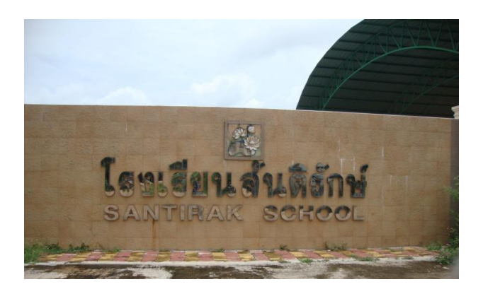
Figure 2.3.2-5 The private school in Wat Luang village

are the novices and receiving the education to study Buddhist scriptures in the temple. It is said that the education in the temple is less interesting comparing to the past few decades past when Buddhist temples provided the bulk of public education to boys who had entered the monastery. Male villagers less than twenty years of age are expected to become a monk to study and practice Dharma for a short period in their life which is usually between the time they finish school and start a career or marry. Villagers said the family earns great merit when one of its sons become a monk.