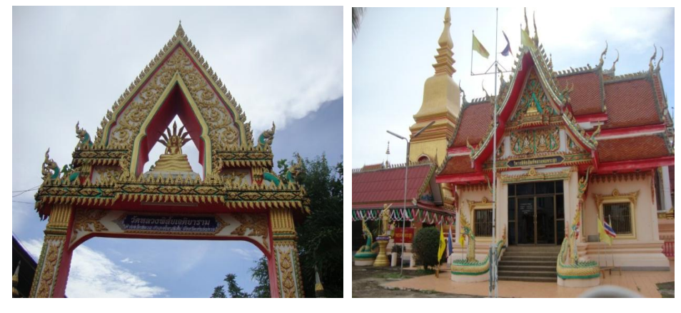
Figures 2.1-2, 3 Wat Luang temple with Luang Phor Phra Suk stupa and museum

The village has its own temple called Wat Luang. Its compound is large and bounded by a fence with four big gateways for each direction. It was built around 1740 and had a story connection with Wat Chorm Nang temple where the main Chao Mae Song Nang shrine is. According to Phra Kru Siritham Phrakun, an abbot of Wat Chorm Nang monastery, a legend of Wat Luang has connection with Wat Chorm Nang temple. It was built in 1740 by a Thai man. While he was building the temple, there was a beautiful high ranking Lao lady, who migrated from Vientiane and built Wat Chorm Nang monastery located three kilometers north of the Wat Laung temple to make her merit. She and the villagers gathered together, dug the ground from the southern part of the village and brought the soil to build the temple. The area where the ground was dug became a lake which is called Nong Chorm Nang. Because of her beauty young Thai man fell in love with her and agreed to help and build a temple of Wat Chorm Nang. When this temple was completed the young man built his temple Wat Luang. In fact, the construction of Wat Luang monastery began before but it was completed after Wat Chorm Nang, as the young man always spent times to come to chat with her. Because she was a good model of womanly behavior and had done great deeds in building the monastery, the villagers then named the monastery Wat Chorm Nang (Temple of a Great Lady) until today.