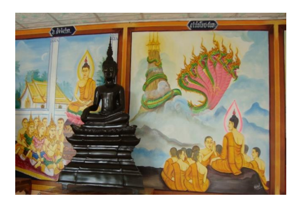
Figure 3.1.1-6 Naga image in Buddhist painting at Wat Luang temple

In Hindu myth, the Nagas are believed to reside on Mount Sumeru, among the other minor deities, and in various parts of the human-inhabited earth. Some of them are water-dwellers which live in streams, others are earth-dwellers which live in underground caverns.