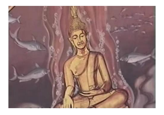
Figure 3.1.1-8 Phra Suk fall down into the bottom of the Mekong River

The legend about Phra Suk, the Buddha image that had fallen down into the bottom of the Mekong River in Vernsuk, Nong Kong village, Phon Phisai District said that because of the respectfulness and loving-kindness of the Nagas to the Buddha. After hearing that the Buddha images were built in Lanxang town, Laos country, the Nagas, who reside in Badan realm or underground, transformed as a monk and asked in particular the Phrasuk Buddha image from the ruler of Lanxang to worship in Badan realm. It was believed that Naga always carry out the eight Buddhist precepts and never kill humans (Reung rao Thamnan Thilaokhan Phayanak, 2011: 32).