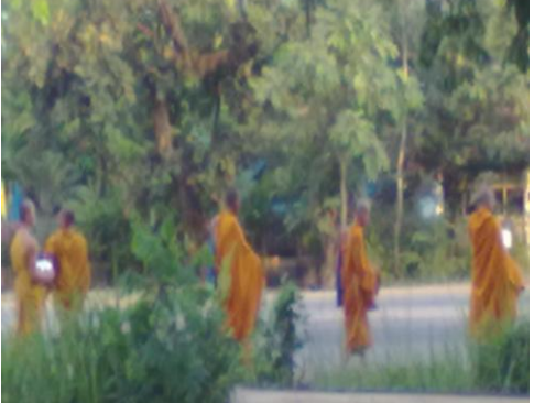
Figures 2.3.2-1, 2 The daily alms collecting in the morning

The most of the villagers were born in the villages as seventy-percent and the remaining twenty- percent were from the same Tambon, same district, and the other tenpercent were from elsewhere especially the male population who married Wat Luang