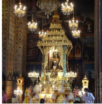
Figures 2.1-12, 13 Phra Seum Buddha statue in Wat Phra Thom Naram, Bangkok

The mystery of these two Buddha images is that during the reign King Rama IV, give Khun Wararhani and Chao Mean, who are the alliance of the King invite Phra Sai and Phra Serm to Bangkok. The caravan of carts which transported Phra Serm and Phra Sai from Wat Ho Kong stopped at Wat Pho Chai and would not move on. Finally, Phra