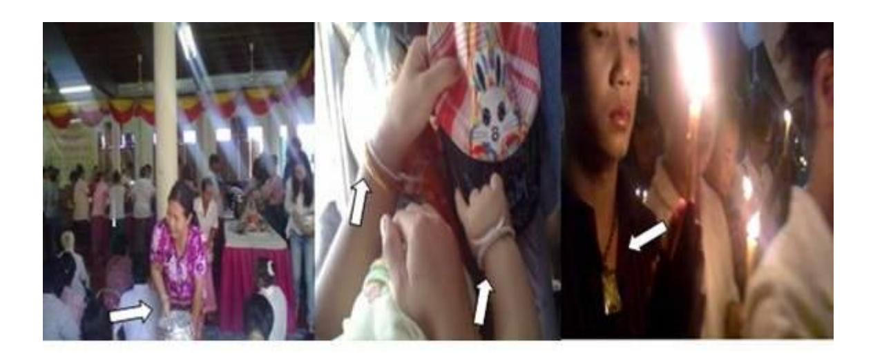
Figures 2.3.2-3, 4 The people tie sacred strings and wear Buddha pendants

All of them have the habit of wearing amulets on their neck and tying a sacred string on their wrists and especially the men have tattoos on their bodies. Some of them even have the neck full of the small Buddha images as pendants. In general, people wear small Buddha image in odd number either one, three, five or seven. These images can be made of ashes, gold, silver, bronze and other kinds of metal. People believe that wearing these things will provide protection, even bring peace, gain popularity, prosperity, and good luck. Some people say that as long as you have such items with you, the ghosts and evil spirits will keep their distance from you.