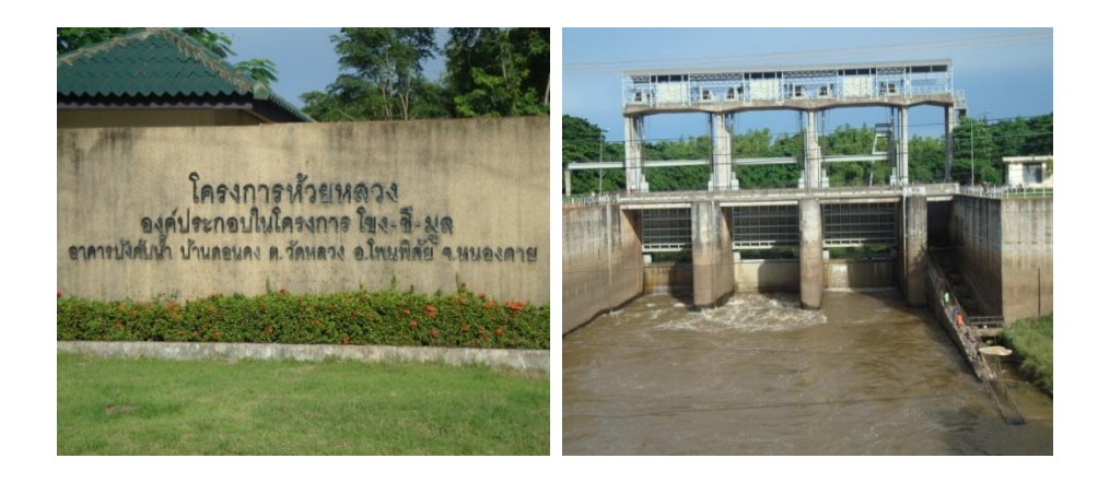
Figures 4.3.2- 2, 3 Huy Luang water Project

In addition, the villagers sometimes are concerned or advised on political issues particularly at the time of a general election to select the headman of the village, commune, district, province, and a party. The villagers might select people representatives up to their recommending.