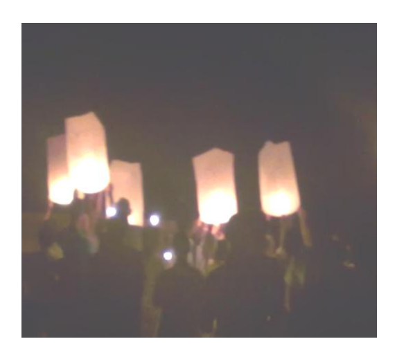
Figure 3.1.3- 4 Blowing the lanterns in Wat Luang

Both items are the main objects in the festival to make a wish and float it in the river as a symbol to fly away misfortune and bad things. Apart from venerating the Buddha with light (the candle on the raft), the act of floating away the candle raft is also a symbolic of letting go of all one's grudges, anger and defilements, so that can start better life. The festival is meant as a time for making merit (Maha Khampuy Philavong, 2009, 112-123).