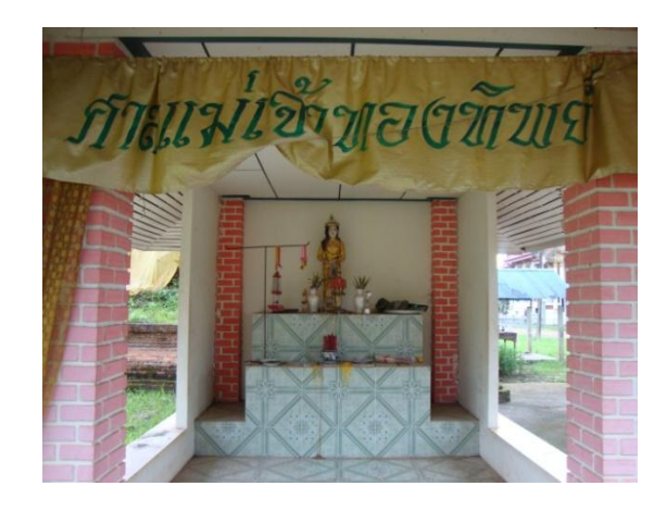
Figure 3.2.1-3 Chao Mae Thong Thib's shrine

Another is Chao Mae Thong Thib shrine where located in Moo Thi 1 of Wat Kong Kraphan Chari temple of Don Kong village opposite of Wat Luang village (The establishment of Don Kong village was separated from Wat Luang village in 2002 because of the increase in the population).