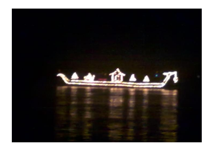
Figure 3.1.3- 3 Phra Tiep

To be more colorful, lighting boats and rafts are used. They are decorated with light in the pictures of Garuda, Kinary Bird, the mythical half bird half humam, and Naga and each prominently display the names of their major sponsors, generally the Communal Administrative Organization that appears clearly in a logo or a phrase of letters. They are called Phra Tiep and represented Krathong . The lanterns are made of color paper and torch to set smoke in lanterns to blow them in wind chill at night, we can see the light from lantern in the sky with the moon shining and stars glittering at night which is a very beautiful.