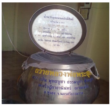
Figures 2.1-10, 11 The sacred water in the Phra Suk's stupa

The other images that have strong connection with this area are Phra Sai, who resides at Wat Pho Chai in Phon Phisai District and Phra Seum, who was invited to Bangkok, now resides at Wat Phra Thom Naram until this day.