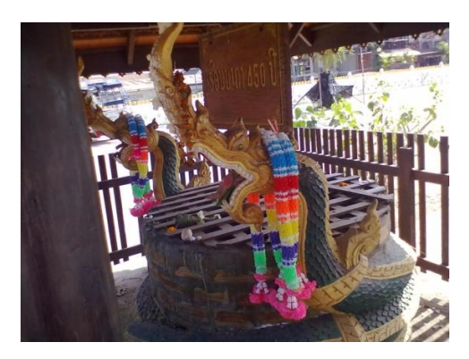
Figure 3.1.1-3 Naga image in That Luang stupa park, Vientiane, the stupa's protecter