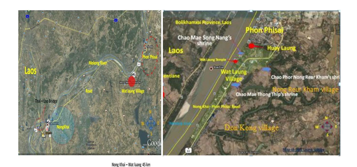
Figures 2.2-1, 2 Maps of Wat Luang village

Just a short distance from this village, on its right or opposite to the Nong Khai-Phon Phisai road connected to Ban Don Kong village, which has its own local monastery, Wat Khong Krapan Chatri and a shrine of Chao Mae Thong Thip near the front gate. At the left connected to Ban Nong Reur Kham village, (Nong Reur Kham village has just separated from Wat Laung village in 2002 because of the increasing number of villagers) which consists of a local monastery, Wat Nong Reur Kham and a sacred Chao Phor Nong Reur Kham shrine, every one of them have their own government appointed headman.