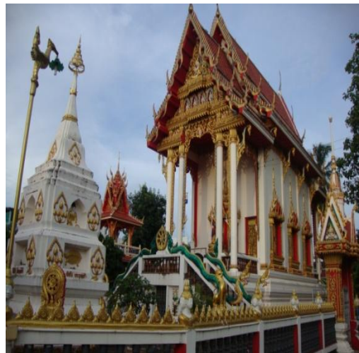
Figure 2.1-14, 15 Phra Sai Buddha stutue in Wat Pho Chai

Local people also built a temple, Wat Sikert located in Phon Phisai and had Phra Seum replica to reside there. Nong Khai people fix celebrate of Phra Sai which hold to perform from the past until the present by fix Sonkran festival (Bun Pimai) to invite Phra Sai to get on the car and move around this area for people to worship and bath every year in the day of ceremony has a miracle of Phra Sai which has rain lightly all day. They believe that it is the miracle of holy deities and serpent together for participate acclaim Phra Sai (Pamphlet of Luang Phor Prasok history).