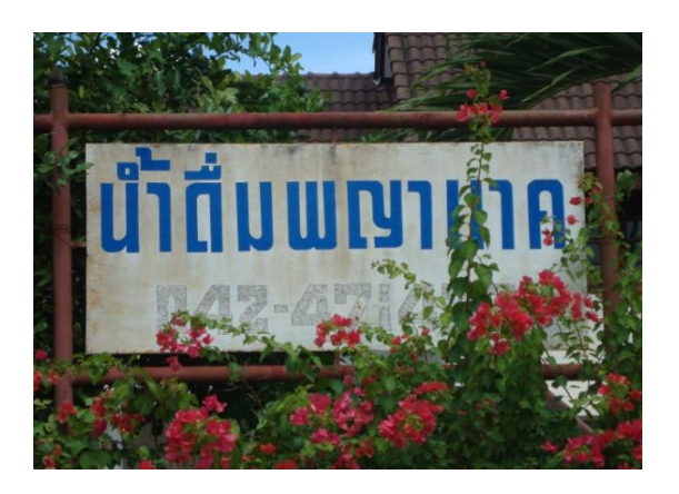
Figure 2.3.3- 2 Phayanak pure drinking water factory in Wat Luang village

A furniture shop is also a special landmark of Wat Luang village, where various furniture and house-building materials like cement, bricks, stones, sand, timber, beds, chairs, ports and are on sale. It also has several kinds of spirit house for sale and said to be a good market which local and outsiders customers always need.