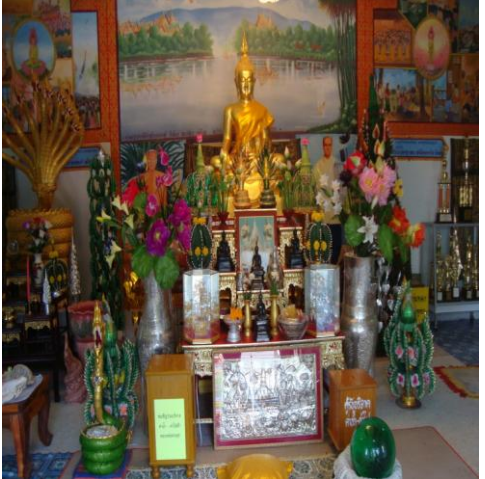
Figures 2.1-8, 9 Phra Suk replica in Wat Luang temple