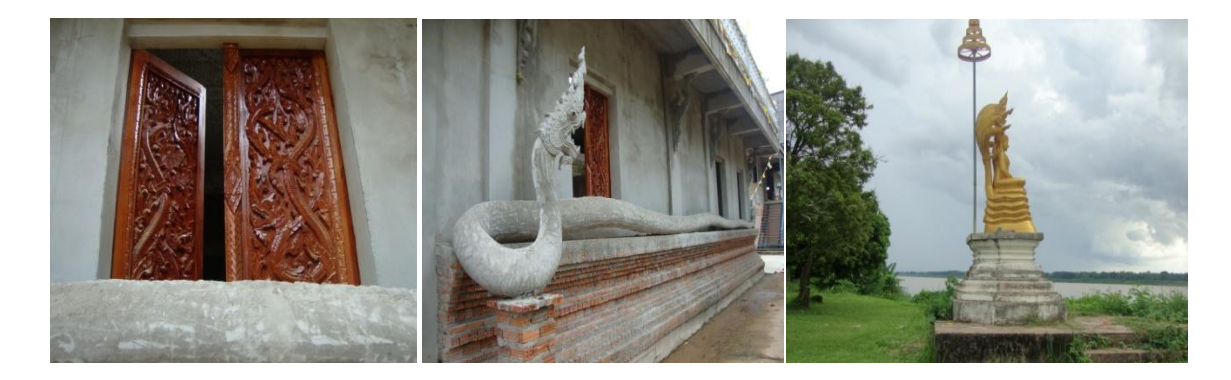
Figures 4.3.1-7, 8 Wat Luang temple hall's doors and Buddha statue in Wat Luang village

The Chaophor Nong Reur Kham sculpture shows the co-existence between Buddhism and the ancestral spirits. It has designed and built stick with Buddha statue by means to worship him as same as worship Lord Buddha. It inspired the villagers to throw all their forces into the construction of the beautiful shrine located in Nong Reur Kham monastery as a symbol of supreme civilization and advancements of the community. It is said that to know how the development of regional people is to observing their local temples.