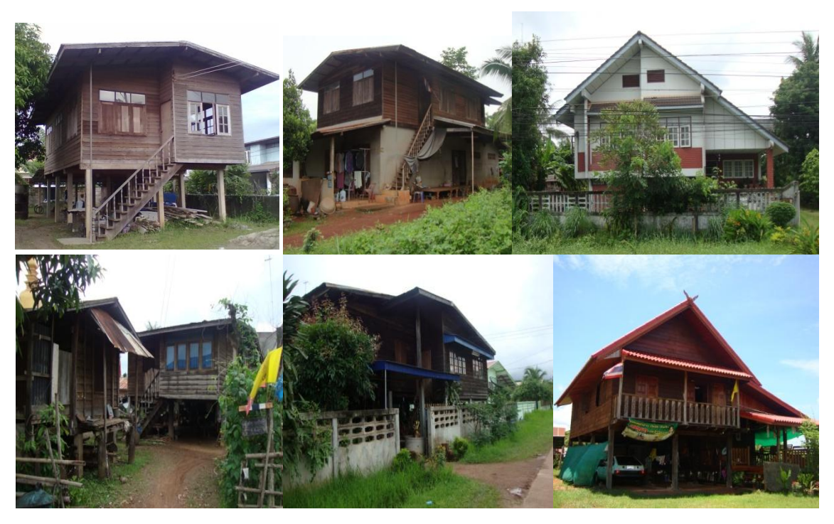
Figures 2.2-3-8 The villagers' houses

brick houses some of the houses still have rice bran in front or beside them. They are built by having the front of the houses facing the main roads or walk ways (Soi). A few guest houses for torrists built in modern style and equipped with good facilities are found. This village has been promoted as a leading tourist destination because it has a well-known monastery, Wat Luang which has a sacred Luang Phor Phra Suk's stupa and this stupa has water seeping from its shaft all year as sacred water. This village is also an area where Naga fireballs always appear on the full moon night of the eleventh lunar month in the river. The abbot built ladders along the Mekong River bank near Wat Luang running down into the river to view the phenomena. These kinds of mysterious things can attract tourists who come not only during the end of the Buddhist lent but also on all occasion to visit Luang Phor Phra Suk's museum in this Wat, worship, pray and bring the holy water back home as lustral water. It was said that those who are ill or sick will be cured when they drink this water and it will generally provide good luck, wealthy, prosperity, and happiness.