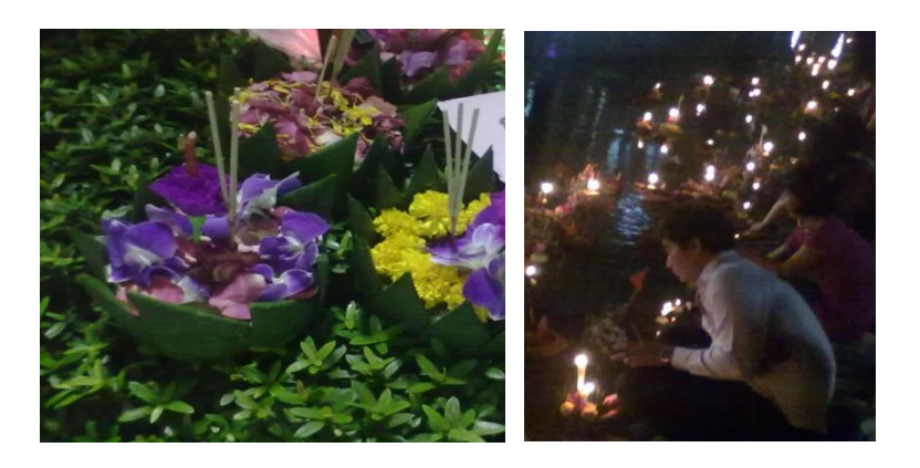
Figures 3.1.3-1, 2 Krathongs

To be more colorful, lighting boats and rafts are used. They are decorated with light in the pictures of Garuda, Kinary Bird, the mythical half bird half humam, and Naga and each prominently display the names of their major sponsors, generally the Communal Administrative Organization that appears clearly in a logo or a phrase of letters. They are called Phra Tiep and represented Krathong . The lanterns are made of color paper and torch to set smoke in lanterns to blow them in wind chill at night, we can see the light from lantern in the sky with the moon shining and stars glittering at night which is a very beautiful.