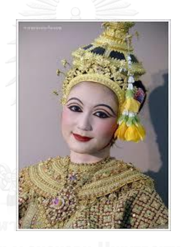
Photo 21: The make-up of Tua Nang in SUPPORT Foundation's Khon performances