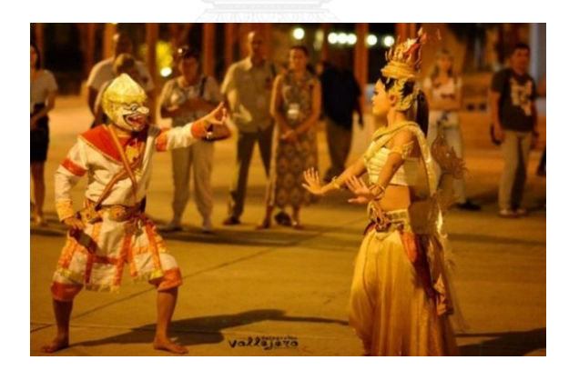
Photo 9: Khon performance: Episode of "Hanuman and Supanna-Matcha" performed at the open space of Siam Niramit Theatre

Moreover, there are also some commercial Khon performances organized as the representation of Thai culture to attract the foreign tourists. One of the examples is a fifteen minutes' Khon performance shows part of the episode " Hanuman and Supanna-Matcha " performed in the middle of the open space before the show starts at Bangkok's Siam Niramit theatre.