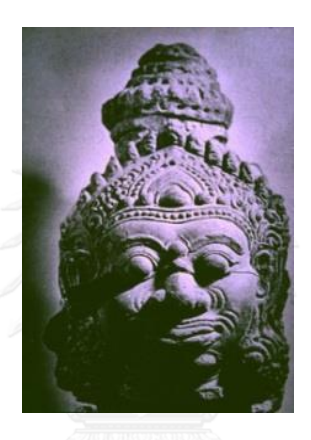
Photo 5: Demon guardian figure made of sandstone from the Sukhothai Period (14-15 Centuries) now displayed at Ramkamhaeng National Museum, Sukhothai Province.

Period (Photo 5); and similar demon figures depicted on a wood carving gable of an ordination hall from Wat Maenang Pleum from Early Ayutthaya Period (Photo 6); the costumes these demon figures wearing and their facial appearances look relatively like the demon characters in the Khon performing art (Rutnin, 1996) (page 30). Therefore, it could be concluded that the Khon costumes and masks are quite likely to have their prototypes from those architectural evidences of Sukhothai and Early Ayutthaya Periods.