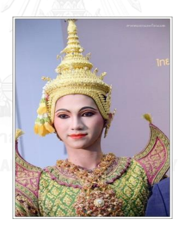
Photo 19: The make-up of Tua Phra in SUPPORT Foundation's Khon performances