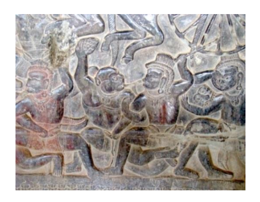
Photo 8: Demons fighting with monkeys in the Battle of Lanka on the bas relief of Angkor Wat