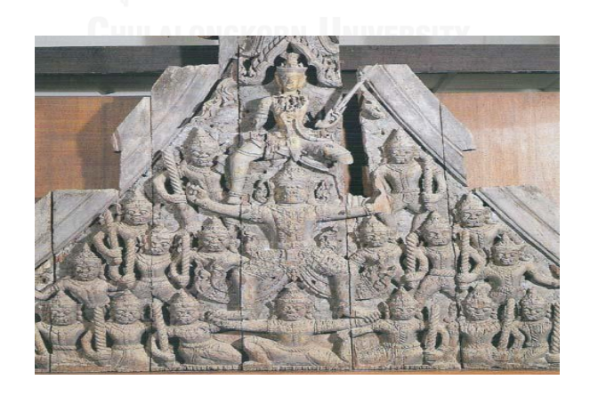
Photo 6: Group of demons depicted on a wood carving of the gable of an ordination hall from Wat Maenang Pleum, Ayutthaya from the Ayutthaya Period.