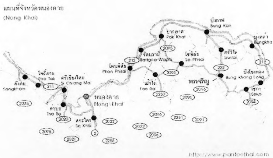
Figure 2 Nong Khai