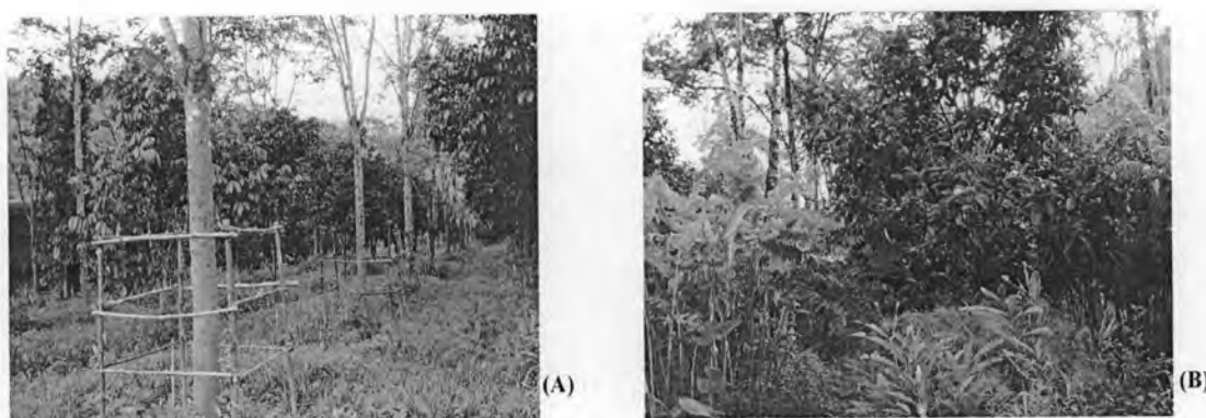
Figure 3.2 (A and B) The organic farm study site, Vimandin farm.

intercropping system design for diverse production and pest management. There are various plants such as Burmese grape, mango, mangosteen, rambutan, Parkia speciosa (sa tor), star fruit, banana, neem, pepper, and flowering plants such as Heliconia sp. Products can be harvested throughout the year. The farm was occasionally irrigated in dry season.