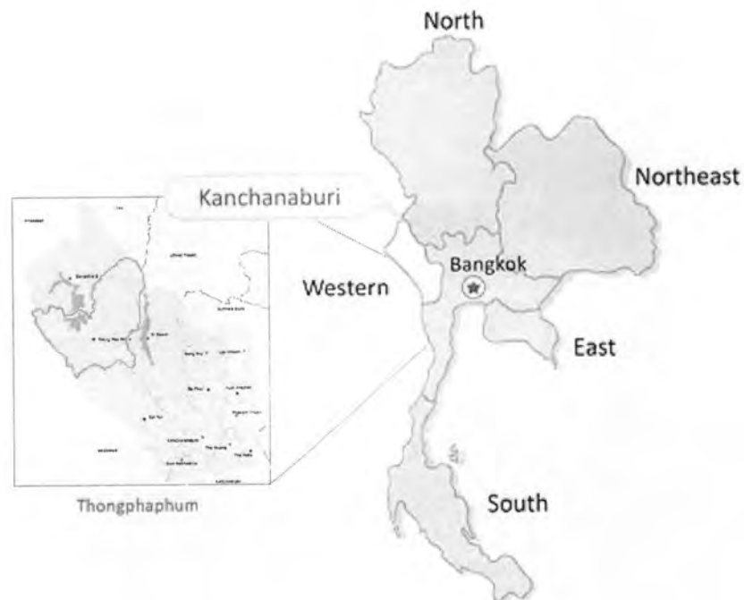
Figure 3.1 Map of Thailand showing the location of Thongphaphum District, Kanchanaburi Province. (Thailandmap.net, 2008).

The district is subdivided into 7 subdistricts, which are further subdivided into 44 villages. Thongphaphum itself is a township covers parts of the Tambon Tha Khanun. There are further 7 Tambon Administrative Organizations (TAO), i.e. Tha Khanun, Pilok, Hin Dat, Linthin, Chalae, Huai Khayeng, and Sahakon Nikhom. The district area consists of forest area mixed with agricultural lands, which includes mostly of croplands (cassava, corn, for example), and fruit orchards.