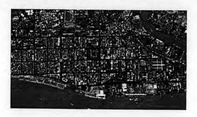
Map 10: City Planning in Grid System and Docklands in Downtown Yangon

known as the downtown and the centre of Chinese and Indian settlements in colonial era. Second, the less densely populated districts north of the Central Business District including affluent neighborhoods for Europeans around the Royal (Kandawgyi) and Victoria (Inya) lakes. This area consists of largely irregular street alignment and is diverse in terms of housing, settlements and social class.<sup>42</sup>