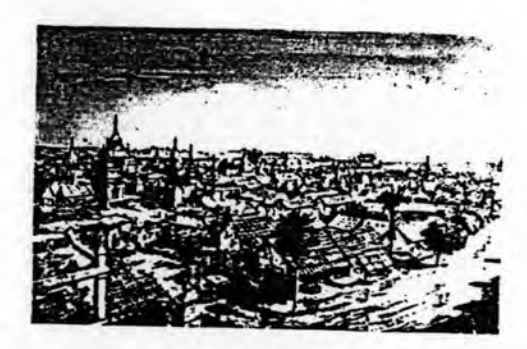
Picture2 City Landscape of Amarapura in the Past