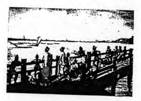
Picturel U Bein Bridge in Amarapura

As a result, Bodawpaya decided to relocate the capital in order to establish a new powerful kingdom. He also contributed a lot of time to building hundreds of temples and pagodas and brought stone inscriptions from Pagan and Ava to Amarapura. "The removal of the new capital does not however come without a price to pay. The move caused great hardships not only to the citizens but also to the country at large which had to pay heavy contributions in money and labor".<sup>16</sup>