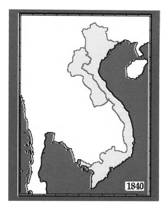
Picture No 3: Map of Vietnam in 1840: Under the Nguyễn Dynasty