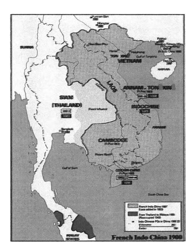
Picture No 5: Map of Vietnam under 1<sup>st</sup> French domination