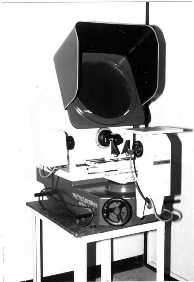
เครื่อง Profile Projector