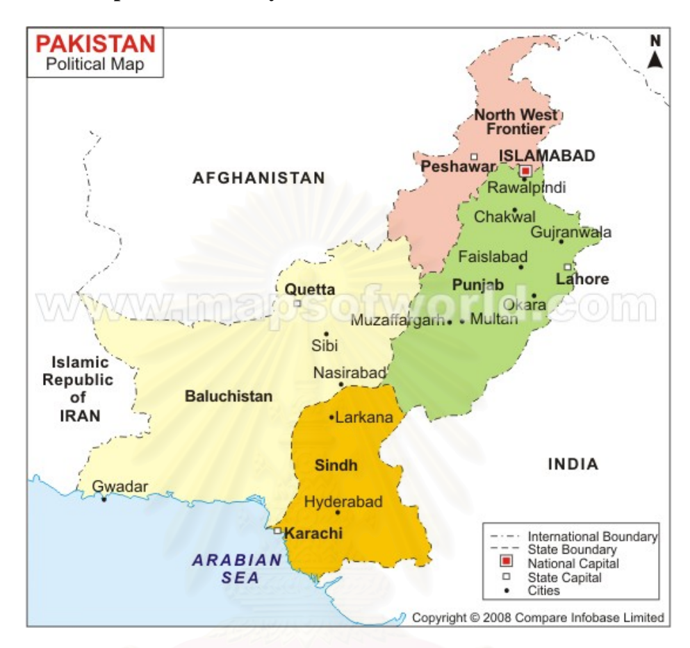
Figure 2 Study area

The establishment of the Balochistan University of Information Technology and Management Sciences (BUITMS) was announced in March 2001, as a step towards the implementation of the Government of Pakistan's National IT Policy and the Action Plan 2000. This being the first Public Sector University of its kind in the country with five faculties including Information and communication technology (ICT), engineering, arts and basic sciences, management sciences and bio-technology. The Federal Ministry of Science & Technology required the government of Balochistan to urgently provide a building to house the proposed institution. The Government of Balochistan complied by allocating Primary Education Directorate (PED) building near Jinnah Town.