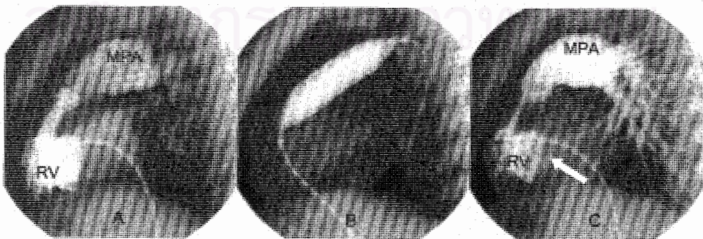
Figure 1. Lateral view of right ventricular (RV) cineangiogram before (A), during (B) and after PBPV (C). Note jet flow across the stenotic pulmonary valve that disappeared after PBPV. Note infundibular narrowing after PBPV (white arrow).

Measurement of the pulmonary valve annulus was done in the cardiac catheterization laboratory mostly using a lateral view of right ventriculogram. After an exchange guidewire is placed through the catheter preferentially into the left pulmonary artery, an oversize balloon catheter with a balloon diameter ratio of 1.0 to 1.5 of pulmonary valve annulus is advanced over the exchange guidewire, with care taken that the wire remains in the distal left pulmonary artery. After the balloon catheter is positioned where