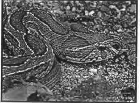
Figure 2 Morphology of Daboia russellii (http://en.wikipedia.org/wiki/Daboia)