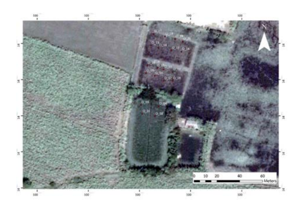
Fig.2 Map of the study area showing sampling locations of non-burning paddy soil inPhra Phutthabat district (n=20) Satellite source: Google Earth. (November 17, 2018). Saraburi Province (Accessed April 16, 2019).