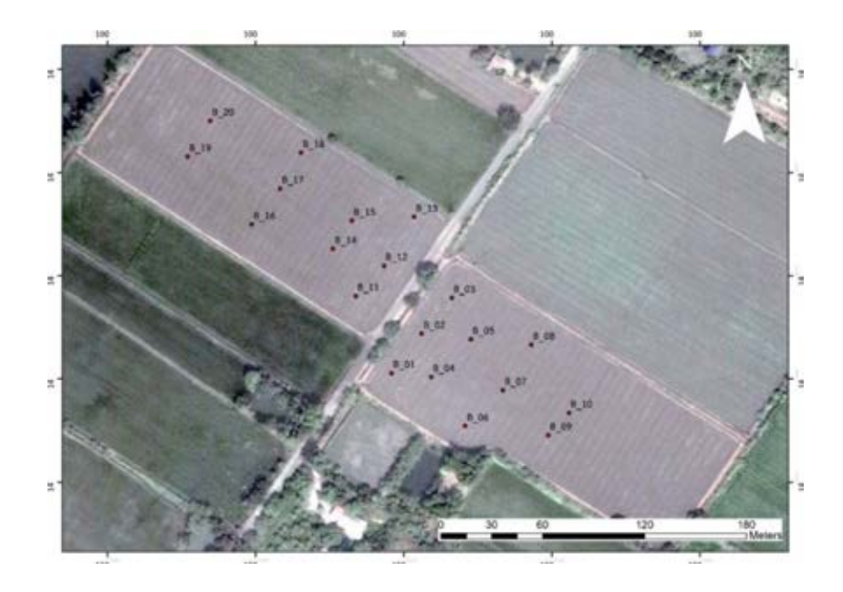
Fig.1 Map of the study area showing sampling locations of burning paddy soil in Nong Don district (n=20) Satellite source: Google Earth. (November 17, 2018). Saraburi Province (Accessed April 16, 2019).