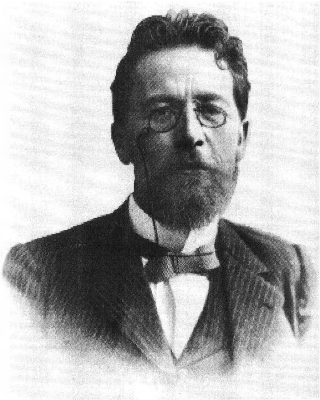
Anton Chekhov, 1860-1904 1