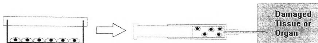
Figure 2.1 Principle of cell therapy. In cell therapy, cells from the patient are cultivated and injected into the damaged tissue or organ. In the therapy of burns and ulcers, the cultivated cells are laid, pipetted or sprayed (Minuth, Strehl, & Schumacher, 2005).

In cell therapy, a suspension of single cells is injected into sick or damaged tissue areas or placed onto them (see Figure 2.1). In this way the body's own regeneration should be promoted and supported. The cells used are in a relatively immature state at the time of implantation and should not develop completely without the influence of the surrounding tissue within the patient's body. The development of a functional tissue and its integration should take place within the surrounding areas. The cells required for this kind of therapy can be isolated from the patient's body (autologous) and multiplied in vitro before the implantation. In the future, totipotent or pluripotent stem cells may become available (Minuth, Strehl, & Schumacher, 2005).